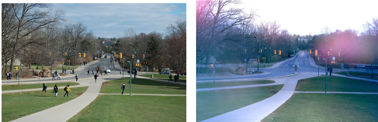
Figure 2. A busy intersection with lots of students, cars, trucks, and busses moving about. The left frame is a normal picture taken at 1/100 sec, the right frame is exposed for 10 min. No moving objects are seen anymore, except for a few very faint shadows. The multiple cars in the left turning lane sit waiting for green, leading to multiple images of running lights in that position. The red-yellow-green traffic lights are all lit at the same time, on average.