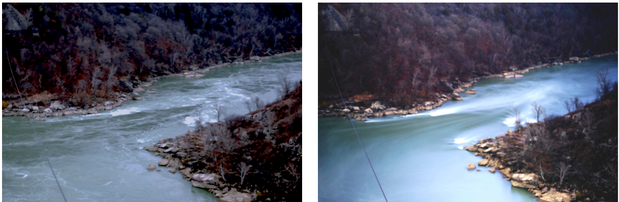
Figure 1. Two images of the same Niagara Falls downstream flow. The left image is an exposure of 1/2 sec, while the right hand image is exposed for 50 sec. Note the flow features visible in the right hand image (stream lines, bow waves, standing waves, vortices, etc.) that are not clearly visible or simply invisible in the left image due to the “noise” of local fluctuations.

Our first experiments consisted of flowing water, in this case the Niagara River just below the falls. The left picture of Figure 1 has a 1/2 s exposure. The right picture is exactly the same but with a strong filter allowing a 50 s exposure. The unsteady flow disappears in favor of smooth streamlines turning to the right and vivid standing and bow waves previously invisible in the “noise” of local fluctuations. We see similar “tranquil” situations in slow-time pictures of trees in the wind and of busy traffic in Figure 2. These pictures illustrate the presence of structure appropriate to different timescales.