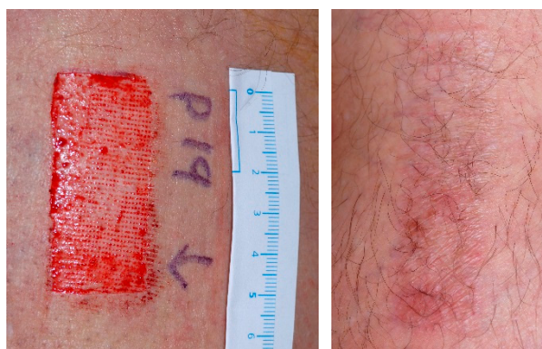
Figure 4. Typical clinical aspect of fresh skin graft wound just before starting TBG-treatment (upper half of the surgical site (left side) and 12 months postoperatively as clinically mature scar (right side) [27].

After 1 year of scar formation there were 158 patients still evaluable for aesthetic assessment with 158 wound sites, treated in one half with TBG and in the other half with standard of care. 39 of 158 patients enjoyed more discreetly pigmented scars due to TBG (Figure 4). 18 of 158 patients presented better aesthetic results related to standard of care. However 101 of 158 patients did not demonstrate any obvious aesthetical differences in aesthetic scar formation comparing TBG and standard of care. Same relations were apparent on lower level of numbers for TBG and standard of care referring to redness, texture and hair growth.