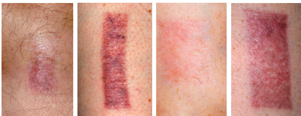
Figure 3. Four different skin graft wounds from four different patients, showing an intra-individual comparison of TBG-treatment (upper half) and standard of care (lower half) for four different results of scar formation [27].

Some cases of TBG treatment (Figure 3, upper half of the former wounds) demonstrated very good long term benefit (Figure 3, left side) in comparison with the site treated by standard of care (Figure 3, lower halves of the former wounds). Other cases demonstrated the superiority of TBG treatment (Figure 3, neighboring the left side), though the aesthetic benefit was poor. In a few cases the effect of TBG and standard of care seems to be almost equal (Figure 3, neighboring the right side) and in very rare cases TBG treatment resulted in a slightly inferior aesthetic result for the patient (Figure 3, right side).