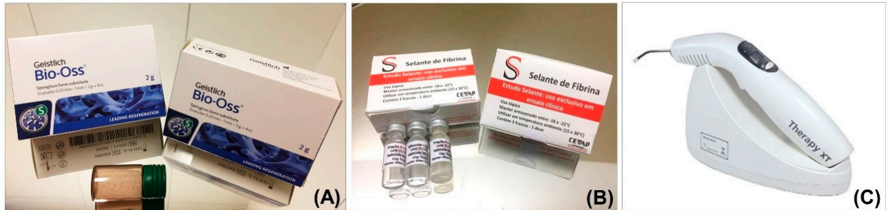
Figure S1: Materials used: (A) Deproteinized bovine matrix (Ministry of Health Registration No. 806.969.30002); (B) Fibrin biopolymer purified from snake venom (Ministry of Health Registration No. 1020140114327 and No. 1020140114360); (C) Therapeutic Laser, Therapy XT DMC® (Ministry of Health Registration 80030810157)