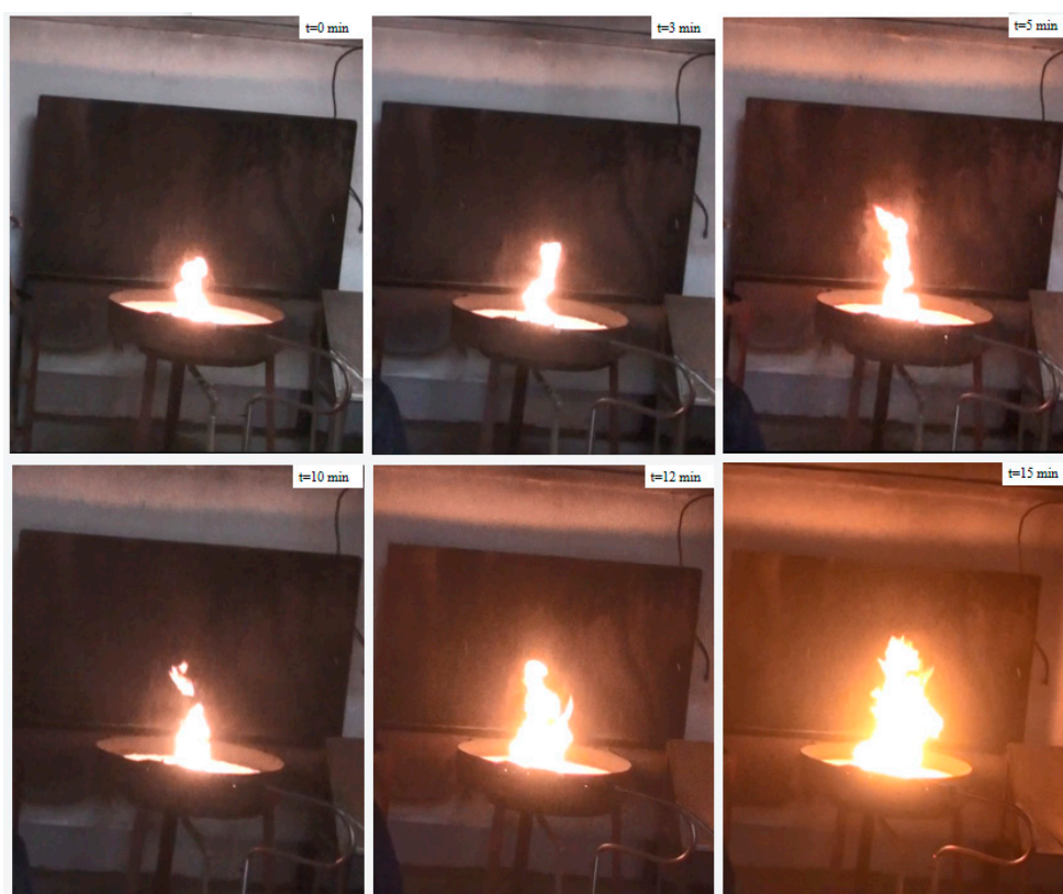
Figure S4. The interaction between flame and foams during burn-back test of the foam-CMPS sample.