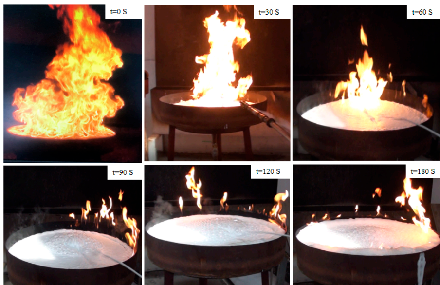
Figure S3. The interaction between flame and foams during fire extinguishing test of the foam-HPMS sample