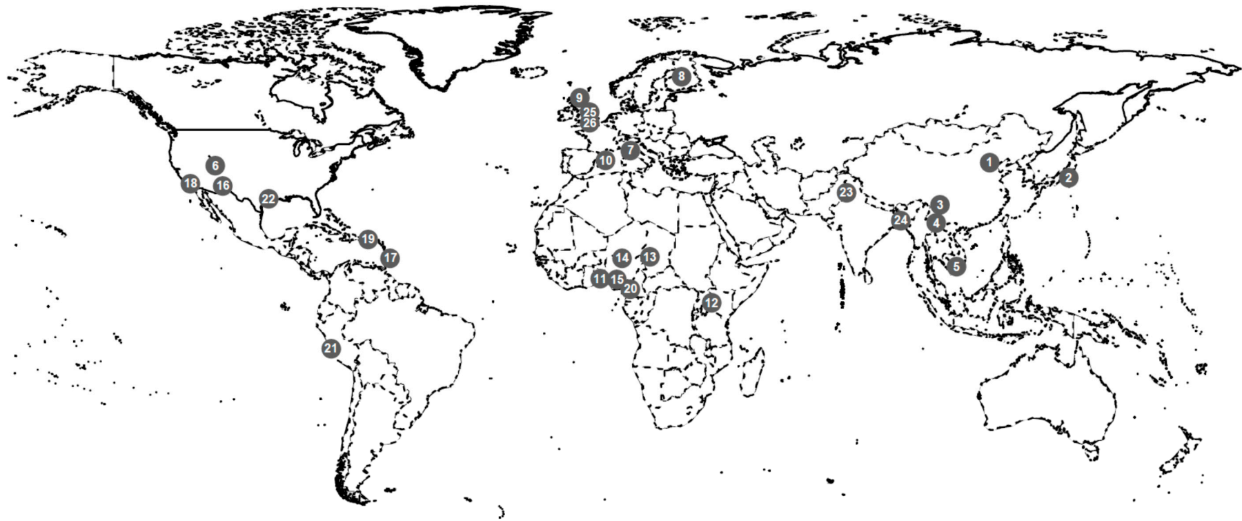
Figure S3. World Map of Phase 3 1000 Genomes Population Samples. Figure S1 displays each of the 26 population samples included in the Phase 3 1000 Genomes data. The numbers correspond to the descriptions that are listed in Table S1.