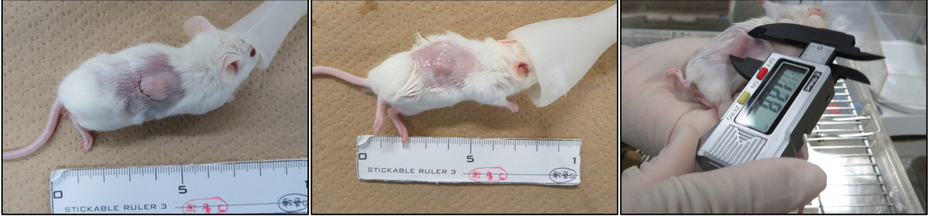
Transplanted day 0 Transplanted day 60 Measurement length