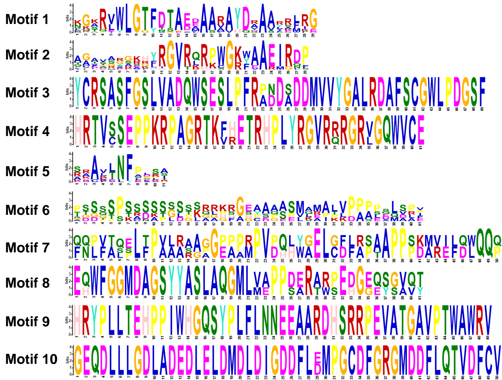
Supplemental Figure S5. Analysis and distribution of conserved motifs in wheat AP2/ERF proteins.