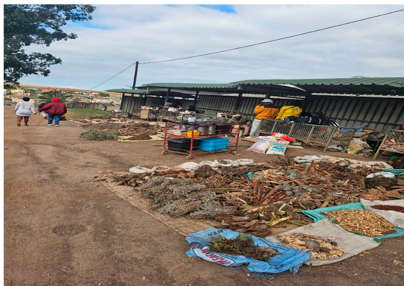
Figure 5. A marketplace in Bizana at the bus rank where informal traders sell various plant parts for different ailments and disorders.

Using purposive sampling, knowledge holders were identified from the bus rank markets in Qonce (formerly known as King Williams Town) a town which is under Buffalo City Metropolitan Municipality and Bizana, a small town which is under the Winnie Madikizela Mandela Local Municipality, Alfred Nzo District Municipality, both towns are in South Africa. Informants were knowledge holders and informal traders, who harvested the crude stems of the plants and sold them in the nearest marketplace, usually at a bus rank (Figure 5). The informants accompanied the researchers to the natural forests to identify various plant species that were used for complexion enhancement.