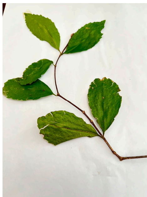
Figure 1. Cassipourea malosana.

The results obtained from the Liquid Chromatography–Mass Spectrometry (LC-MS/MS) yielded a total number of twenty-four compounds of different chemical classes, including fatty acids, steroids, di- and tri-terpenoids, flavonoids, phenolic acids were detected, and eighteen among them were tentatively identified (as summarized in Table 1).