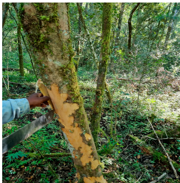
Figure 4. Illustration of the stem bark harvesting demonstrating the potential to destroy the plant.

The harvesting and trade of plant material from rural communities for medicinal purposes has been and continues to be a contentious issue, especially in terms of biodiversity conservation [14]. Over-exploitation of plants for medicinal purposes for commercial trade endangers the survival of many species, as it is a stem bark that is harvested destructively, this results in death through ring barking of individual trees (Figure 4). Hence, conservation regulations and programs must be implemented. Increased public awareness would aid in the abolition of prejudices against medicinal plant production [1,12,14].