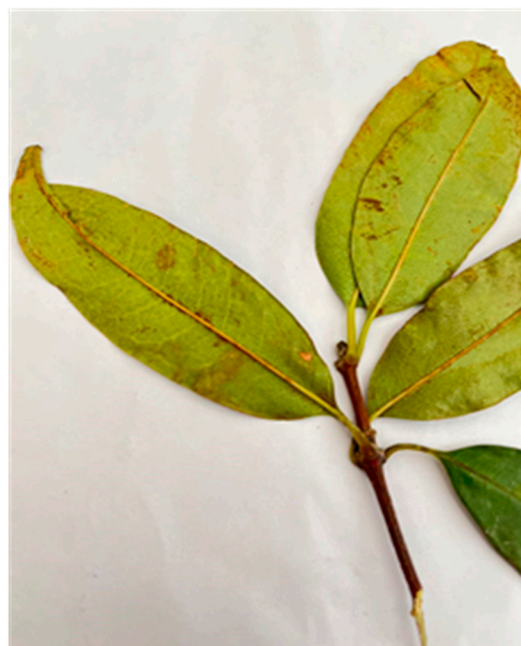
Figure 2. Cassipourea gummiflua var. verticillata.

The first eluted compound was identified as hexose/glucose with a mass of 215 m/z at 0.99 min which was already reported by (Sans et al., 2017) appeared in two plant extracts, along with lynoside (551 m/z ), methyl linoleate (293 m/z ), cassipourol (293 m/z ), decahydroretinol (295 m/z ) and emodin 6,8-dimethylether (297 m/z ) which eluted at 4.83, 8.06, 9.53, 10.10 and 10.63 min, respectively. Lupeol eluted at 3.02 min and its derivative lupeol sterate (4.25 min) were identified with a mass of 425 m/z and 691 m/z , respectively [22,23,25]. Flavonoids such as isorhamnetin-3- O -rhamnoside (461 m/z ), 2 \alpha ,3 \alpha -Epoxyflavan-5,7,4'-triol-(4 \beta \rightarrow 8)-afzelechin (543 m/z ), and tricin (329 m/z ) eluted at 3.21, 5.53 and 6.98, respectively. Some of the compounds were terpenoids such as ent -atis-16-en-19-oic acid and ent -kaur-16-en-19-oic acid eluted at 8.49 and 12.35 min with mass 337 m/z and 309, respectively. According to the literature, azelaic acid [39,40] and tricin [41,42] were reported to inhibit tyrosinase significantly.