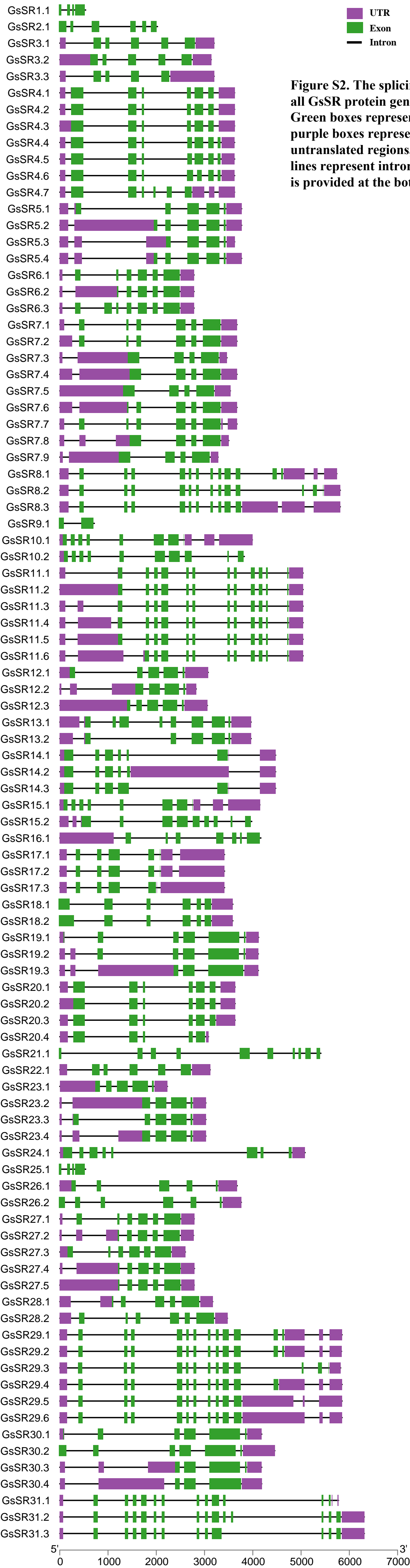
Figure S2. The splicing patterns of all GsSR protein gene transcripts. Green boxes represent exons, purple boxes represent untranslated regions, and black lines represent introns. A scale bar is provided at the bottom.