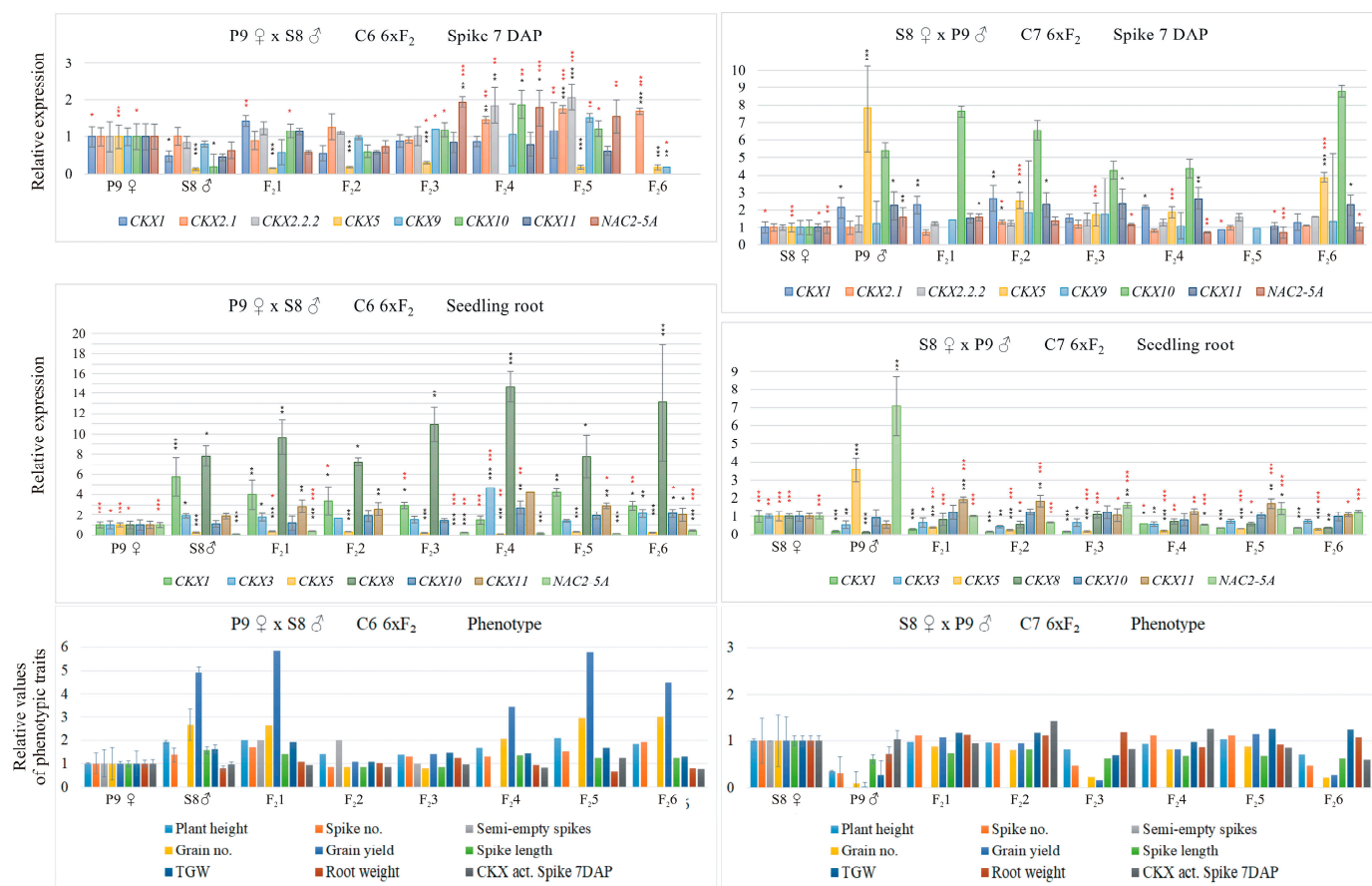
Figure 2. TaCKX GFM and NAC2 expression patterns in 7 DAP spikes, seedling roots, and phenotypic traits in mother, pater, and their six F 2 progeny, from crosses of awned mother and awnless pater, P9 × S8 (C6), and awnless mother and awned pater, S8 × P9 (C7). Data represent mean values with standard deviation and are related to mother set as 1.00. Black and red asterisks indicate statistical significance compared to maternal parent or paternal parent, respectively (* 0.05 > p \geq 0.01 , ** 0.01 > p \geq 0.001 , *** p < 0.001 ).

The expression of the TaCKX GFM and NAC2 in 7 DAP spikes and seedling roots, as well as yield-related traits, in the awnless mother crossed with the awned pater (C7) were opposite to those of the C6 cross. The pattern of higher expression of TaCKX1 , 5, 10, 11 in the 7 DAP spikes of the pater was transmitted to the F 2 progeny. The very low expression of TaCKX1 , 3 in the pater roots was also low in the F 2 progeny. However, the very high expression of TaCKX5 and NAC2 was much lower in F 2 , and in the case of TaCKX5 , it was even lower than in the mother. Very low parameters of grain number, grain yield, and TGW in the pater were in the F 2 progeny slightly higher than in the pater or similar to the mother.