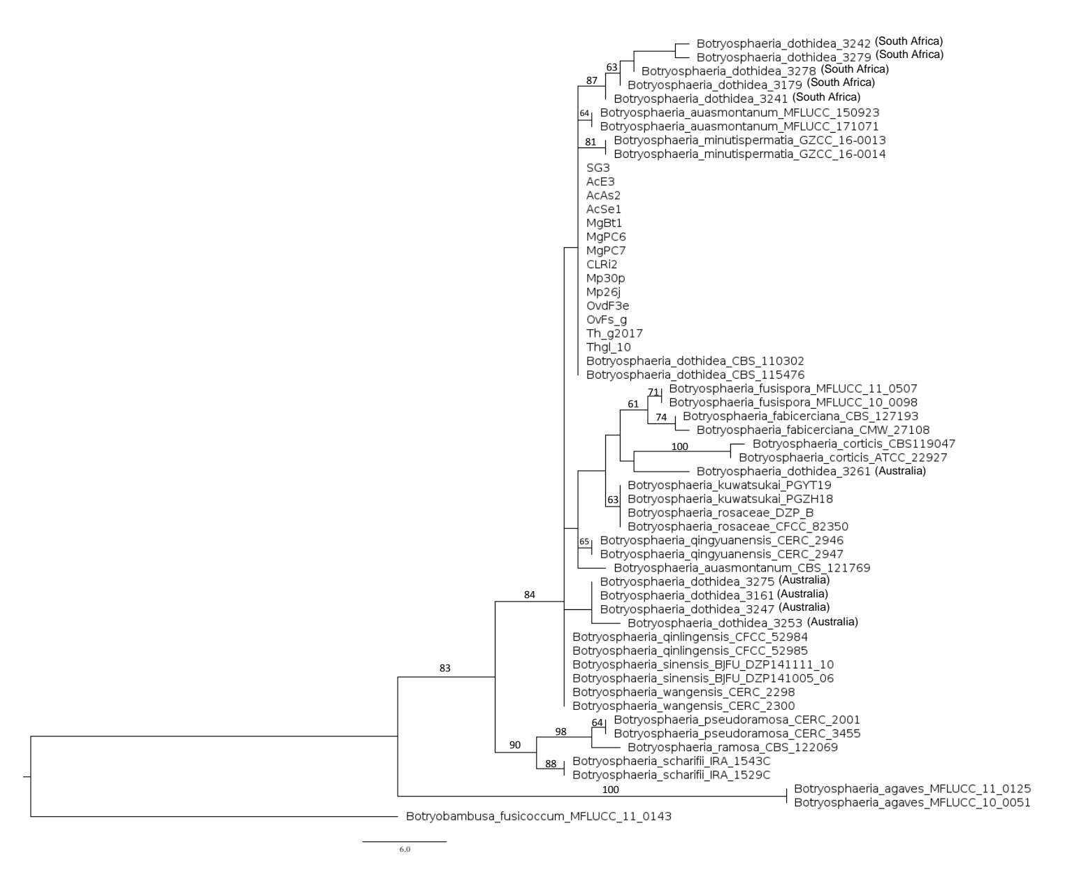
Figure S3. One of the 1000 most parsimonious trees resulting from the analysis of concatenated ITS and TEF1 sequences. Maximum parsimony bootstrap values ( \geq 60%) based on 1000 replicates are shown on the branches. The tree is rooted with Botryobambusa fusicoccum (MFLUCC 11-0143).