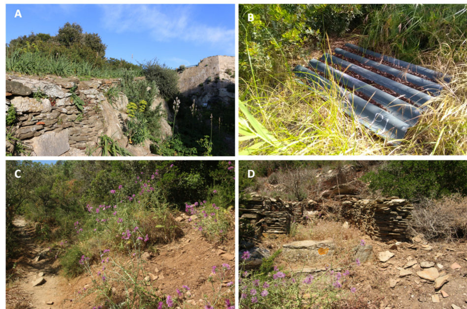
Figure 2. Sampling locations on Port-Cros before (A,B) and after wild boar outbreak in 2016 (C,D). Image (A) shows an intact dry stone wall. Image (B) shows corrugated fibrocement coverboard positioned along a hedge in a meadow. Image (C) shows rooting of the ground, leading to the disappearance of the herbaceous layer and of many shrubs. Image (D) shows the partial destruction of a stone wall. Overall a variety of habitat types was affected, we estimated that 60% to 80% of the whole area was plowed.