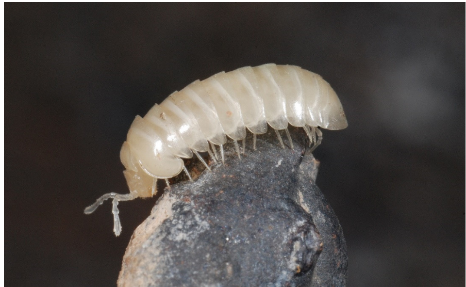
Figure 12. The eyeless Glomeris speobia is the only troglomorphic millipede so far known in the Canary Islands.

is exclusive to Cueva de Felipe Reventón [55]. The highly diversified spider genus Dysdera is represented by five species occurring in both caves, one of them ( D. unguimmanis ) highly troglomorphic and probably parthenogenetic, since no males have ever been found (Figure 16). Each one has a different epigeal sister species, so they originated by five independent colonization events of the underground environment [56]. Among troglomorphic web spiders Troglohyphantes oromii is the most abundant (Figure 17), not only in these two caves but in the rest of the island except in Anaga; a similar situation is that of the widespread centipede Lithobius speleovulcanus .