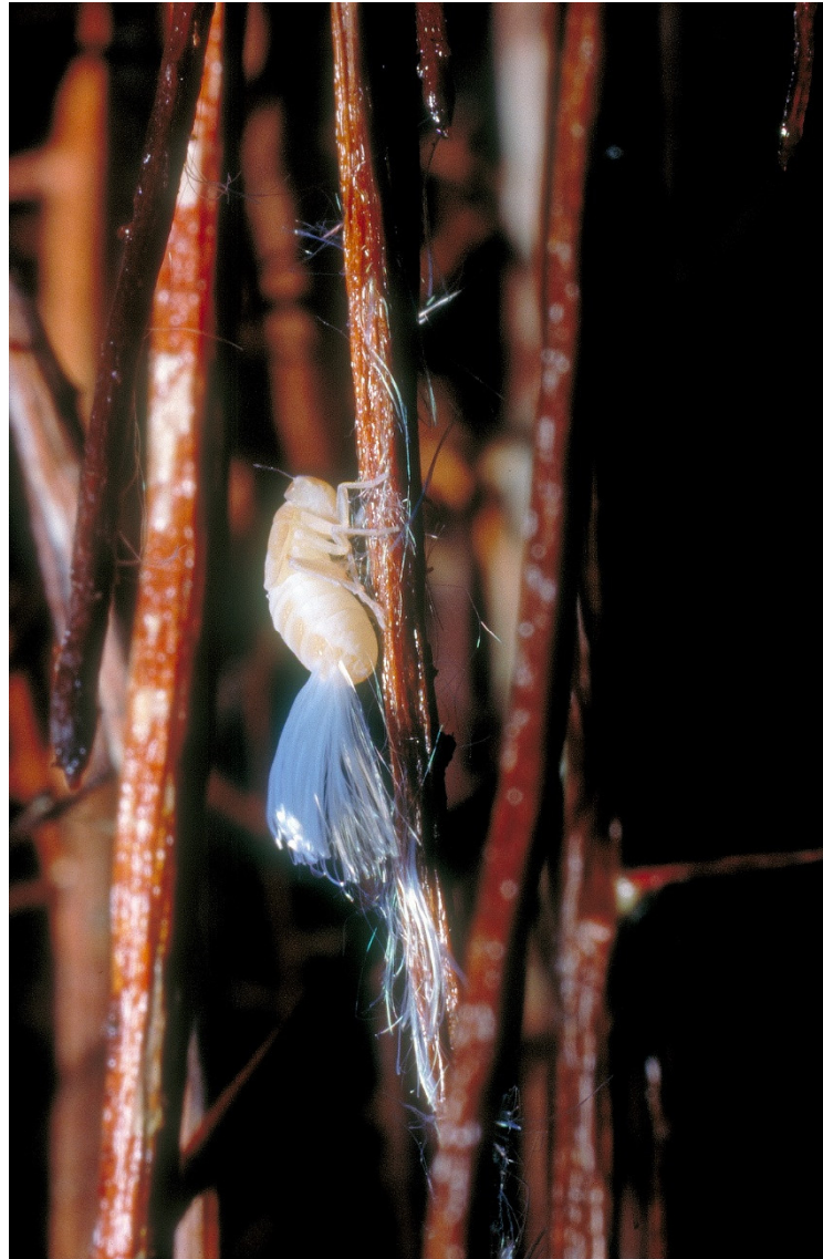
Figure 10. The planthopper Tachycixius lavatubus is the most abundant troglóbiont in these caves.

twilight zone close to entrances, these flying insects are preyed on by the abundant spider Meta bournetii Simon, a typical eutroglophile with permanent populations completing its life cycle inside and rarely outside the caves [41].