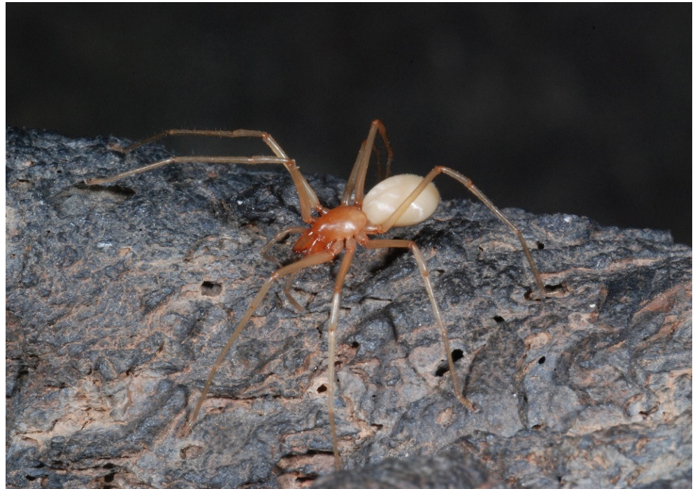
Figure 16. Female of Dysdera unguimmanis , one of the five different troglobiotic species of the genus recorded in these caves.