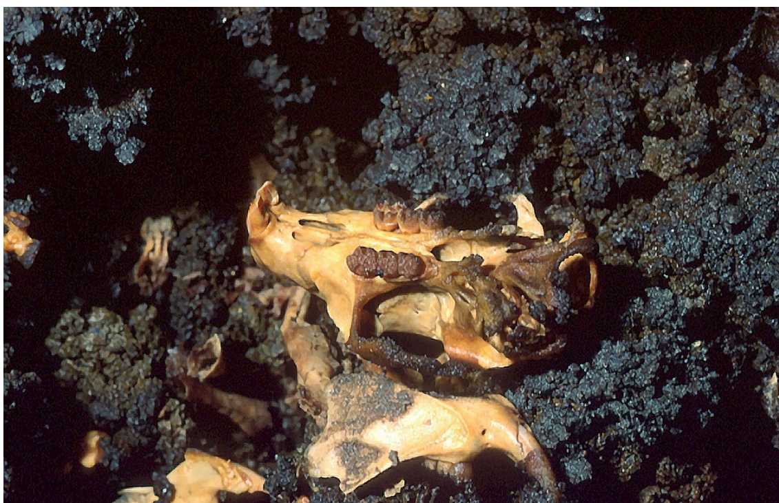
Figure 21. Skull and other subfossil remains of the Tenerife giant rat found in Sobrado Inferior.