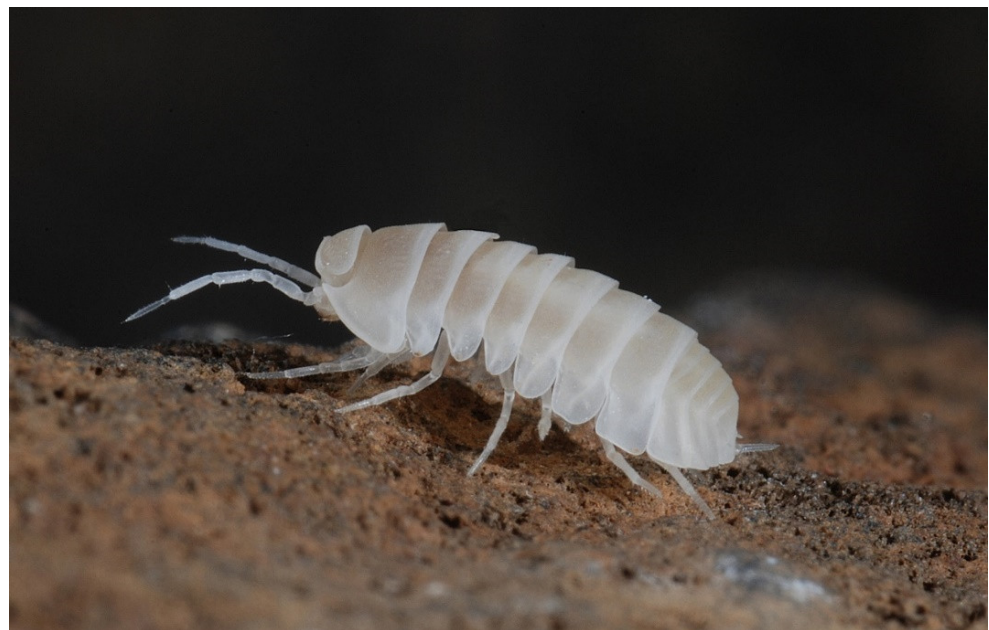
Figure 13. The woodlouse Venezillo tenerifensis is widespread in almost all suitable underground environments on Tenerife.