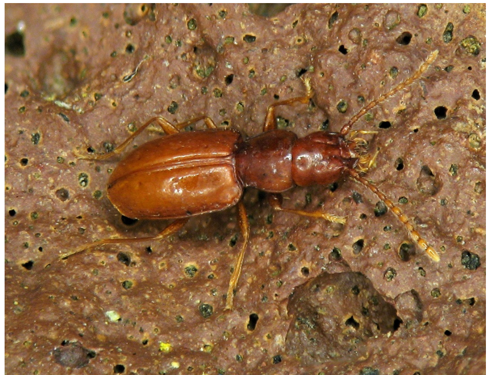
Figure 19. The small ground beetle Spelaeovulcania canariensis has no other related species on the Canary Islands.