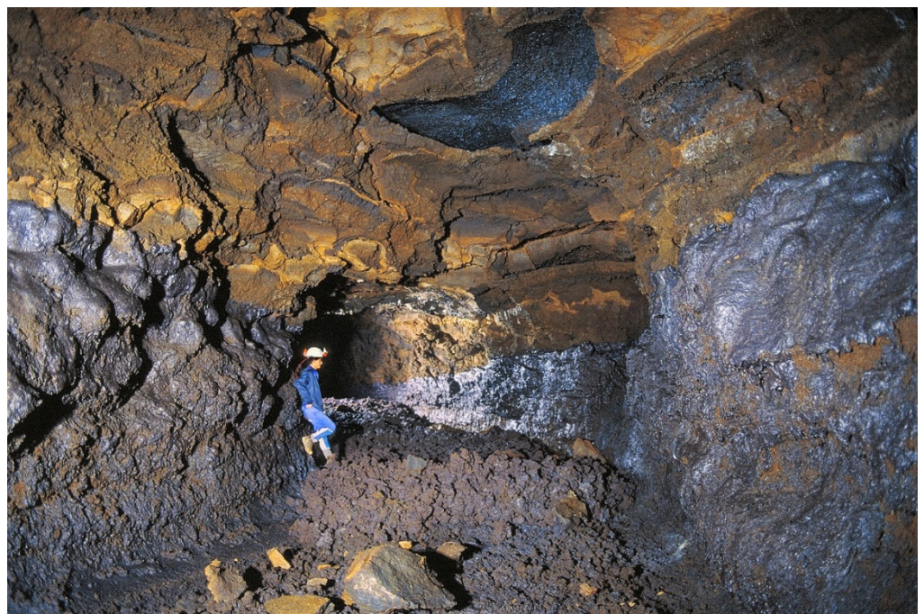
Figure 7. Vitreous black stripe on the walls of Ingleses Gallery. Re-excavation of the ceiling showing the pahoehoe structure. The very last flow stopped and formed a rough step.

In the Sobrado Superior sector, the geomorphological beauty of its galleries and its didactic interest are notable. There are side terraces, multiple levels marked by lava when changing height, effects of centrifugal force on lateral benches, etc. The area called the Labyrinth is an intricate network of interconnected tubes of almost circular section and smooth walls, which can rival the other existing labyrinth in Cueva de Felipe Reventón (Figure 6).