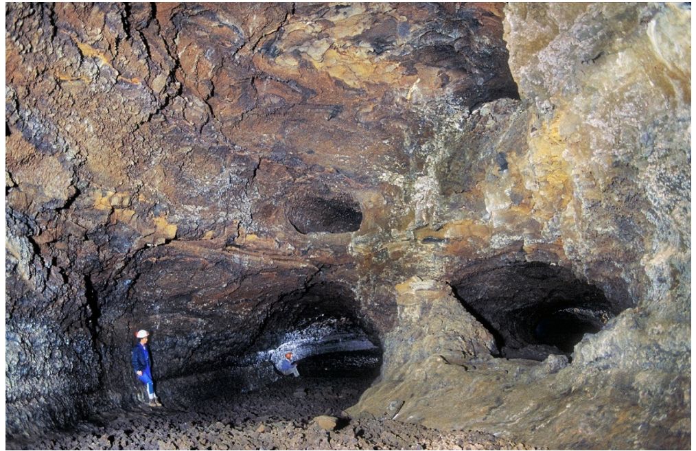
Figure 4. Complex system of tubes at different levels, the highest ones captured by upwards re-excavation and collapses of the ceiling. Ingleses Gallery.