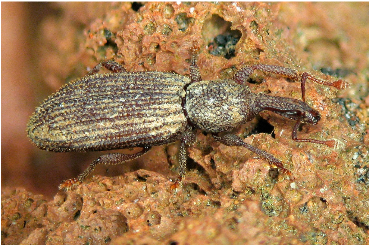
Figure 11. Oromia hephaestos is a scarce weevil known only from the Cueva del Viento System.

Detritivores are more varied than root-feeding species, but due to the broad spectrum of feeding behavior necessary to survive in the cave, it is often difficult to know the preferences of each millipede, woodlouse, springtail or cockroach. The pill-millipede Glomeris speobia and the woodlouse Venezillo tenerifensis are among the most widespread troglobionts on the island and are regularly seen in both the Icod caves discussed here (Figures 12 and 13). The millipede genus Dolichoium is a paradigm of island radiation with 21 endemic species to Tenerife, three of them troglobionts [51] (Figure 14); Dolichoium labradae and D. ypsilon are becoming rarer in these caves, probably due to the increasing abundance of the alien, invasive troglophile Blaniulus guttulatus (F.). The woodlouse Porcellio martini is also scarce, found here and there in other caves of the island. Another woodlouse Trichoniscus bassoti and the springtails Troglopedetes vandeli and T. cavernicolus may not be correctly identified [52,53], since the presence of non-endemic troglobionts on an oceanic island is not conceivable due to their inability to disperse over distances across the sea.