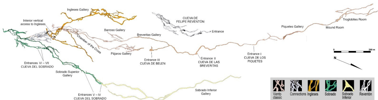
Figure 2. Survey of Cueva del Viento System, with different colors for the main sections, and indication of all accessible entrances. Assemblage partially based on other previously published maps [22,23], with permission.

Surveyed: 17.032 m + 1.845 m (Felipe Reventón)