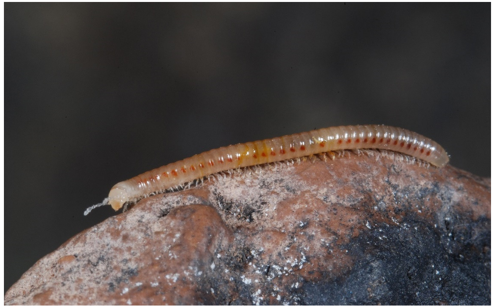
Figure 14. Dolichoium ypsilon , one of the two troglotrophic millipede species of the genus occurring in the Icod caves.