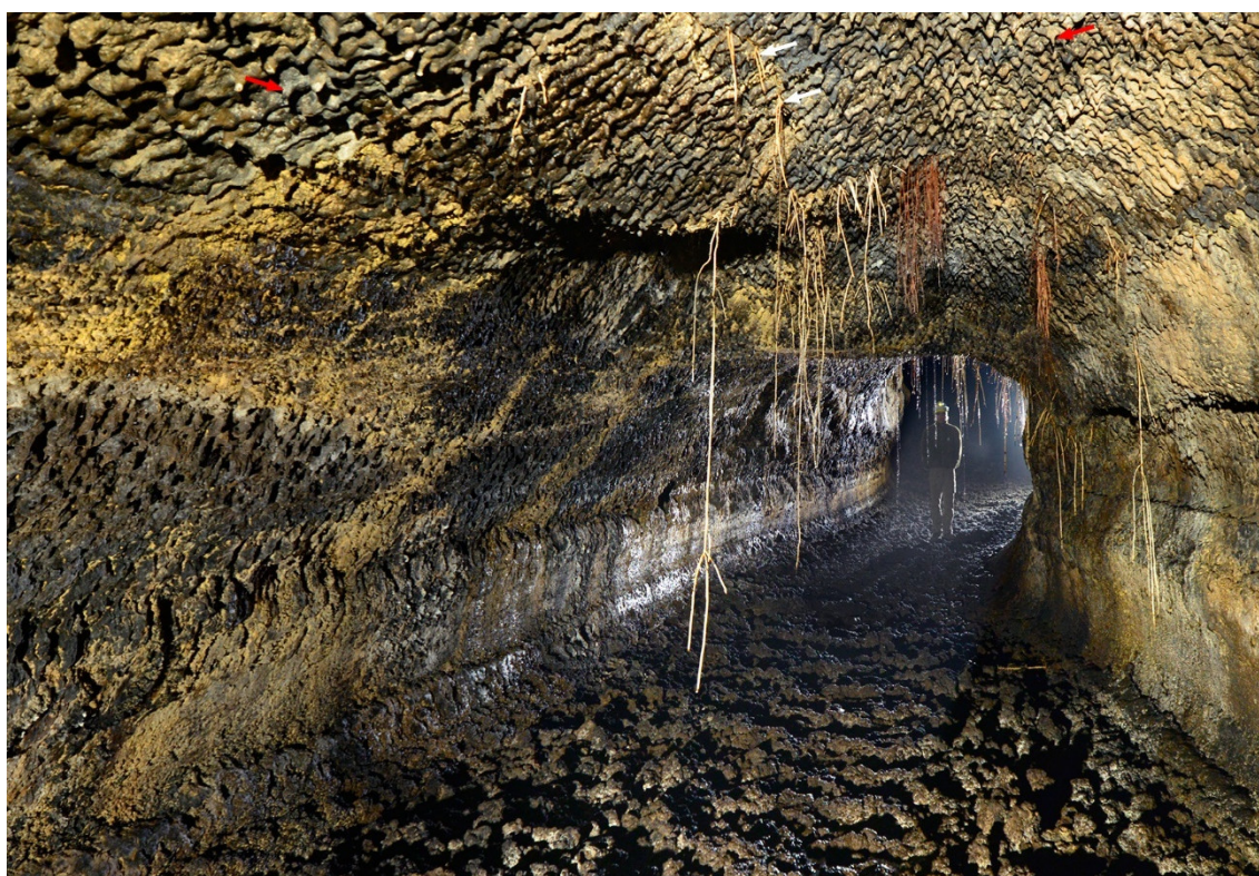
Figure 3. Passage of Cueva del Viento (Breveritas) with the original ceiling evidenced by the abundant small stalactites of lava (red arrows) and with dangling roots (white arrows).

The mapped extent of Cueva de Felipe Reventón is 1845 m so far measured, but the complete survey has never been finished and it is probably something over 3000 m in length [24]. The only entrance to Felipe Reventón is in a public property also belonging to the Cabildo de Tenerife, but most of the upper part of the cave lies under private land with a few houses. This entrance is at 628 m a.s.l. just at the lower end of the cave, and no different sector names are used for partial galleries. It is a rather labyrinthine system of interconnected galleries with a relatively short distance (438 m) between upper and lower extremes (Figure 2), and the internal dimensions are generally somewhat smaller than the main galleries of Cueva del Viento.