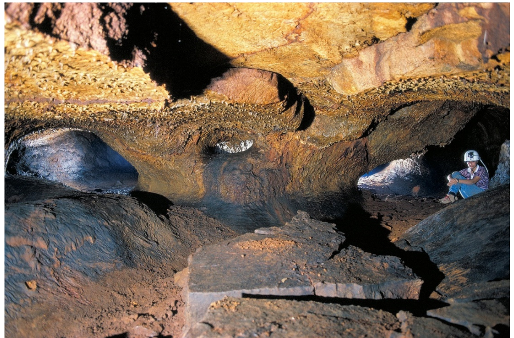
Figure 6. Network of conduits with smooth surface formed by very fluid lava in Cueva de Felipe Reventón. Foreground: last blocks fallen from the roof after the eruption.