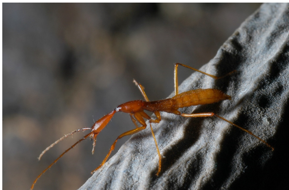
Figure 20. The highly troglomorphic Domene vulcanica is one of the six cave-adapted rove beetles known from these caves.