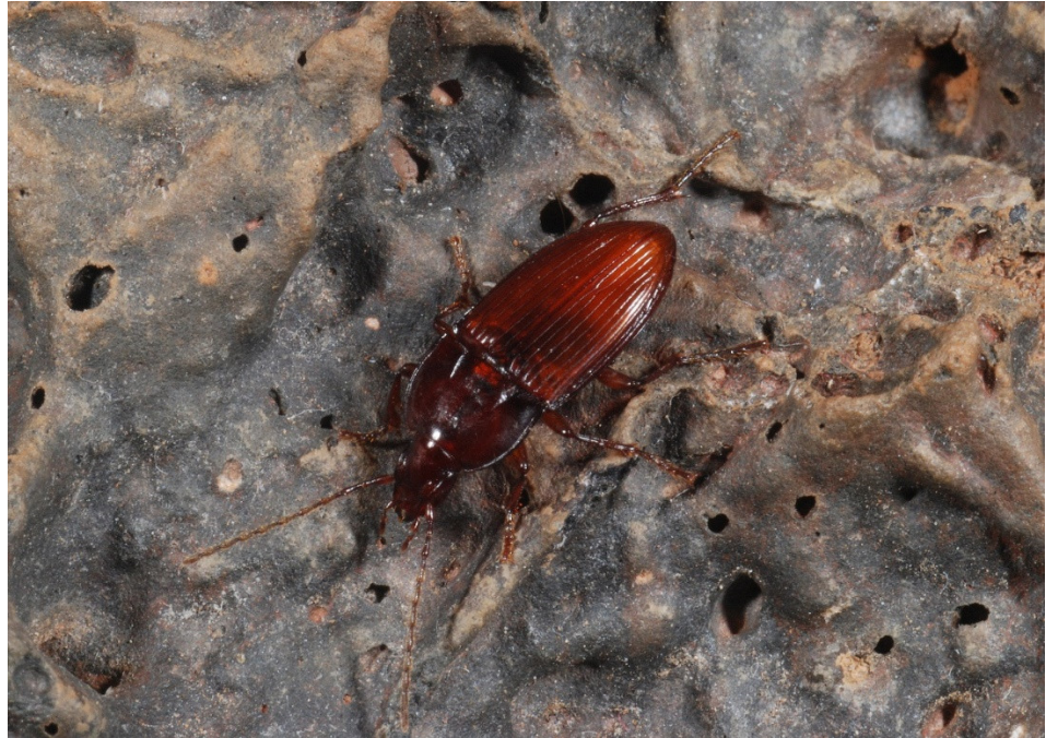
Figure 18. The eyeless ground beetle Gietopus martini belongs to a monospecific genus endemic to Tenerife.

moth Schrankia costaestrigalis . The abundant larvae of the subtroglophile winter crane fly Trichocera maculipennis Meigen capture their preys in sticky silk threads, being important predators in most of the cave communities of Tenerife.