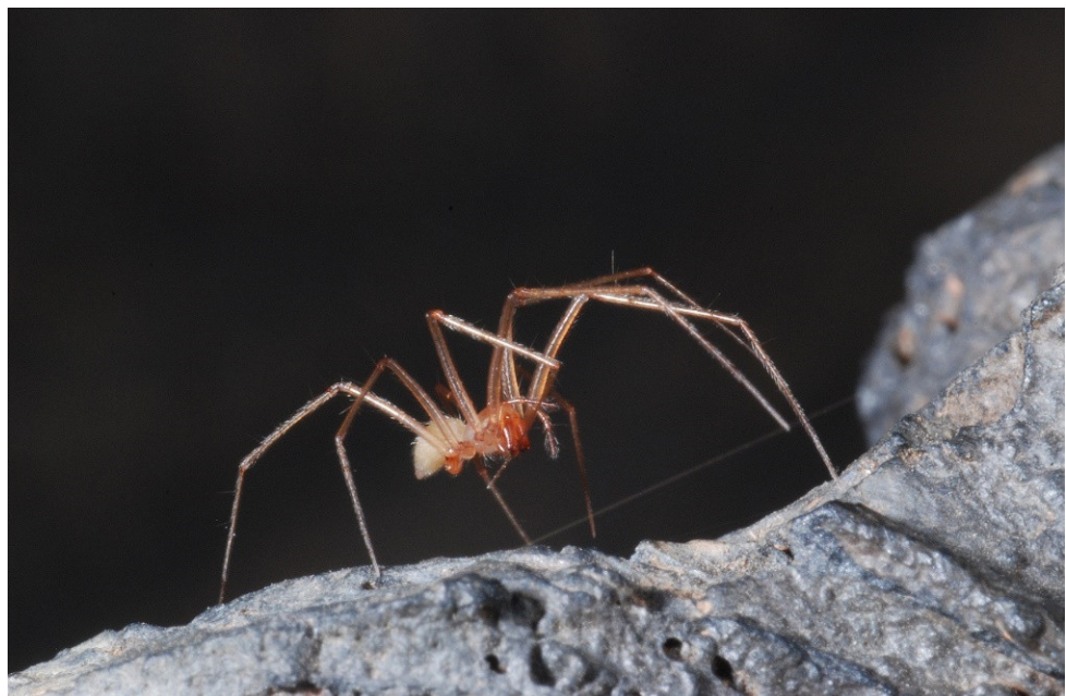
Figure 17. Female of Troglolyphantes oromii , the most abundant spider in Cueva del Viento System.

Besides the subterranean obligate fauna, the shallowness of these caves facilitates the input of troglaxene and subtroglophile animals. Thus, the total number of arthropod species found in them roughly doubles the number of troglobionts [58], but the troglaxenes are almost absent in the deepest levels of Breveritas Superior and Sobrado galleries. Local eutroglophiles are usually widespread species, some introduced like the millipedes Blaniulus guttulatus and Choneiulus subterraneus (Silvestri), and some probably native species like the spider Meta bourneti , the psocid Psyllipsocus ramburii (Selys-Longchamps) and the