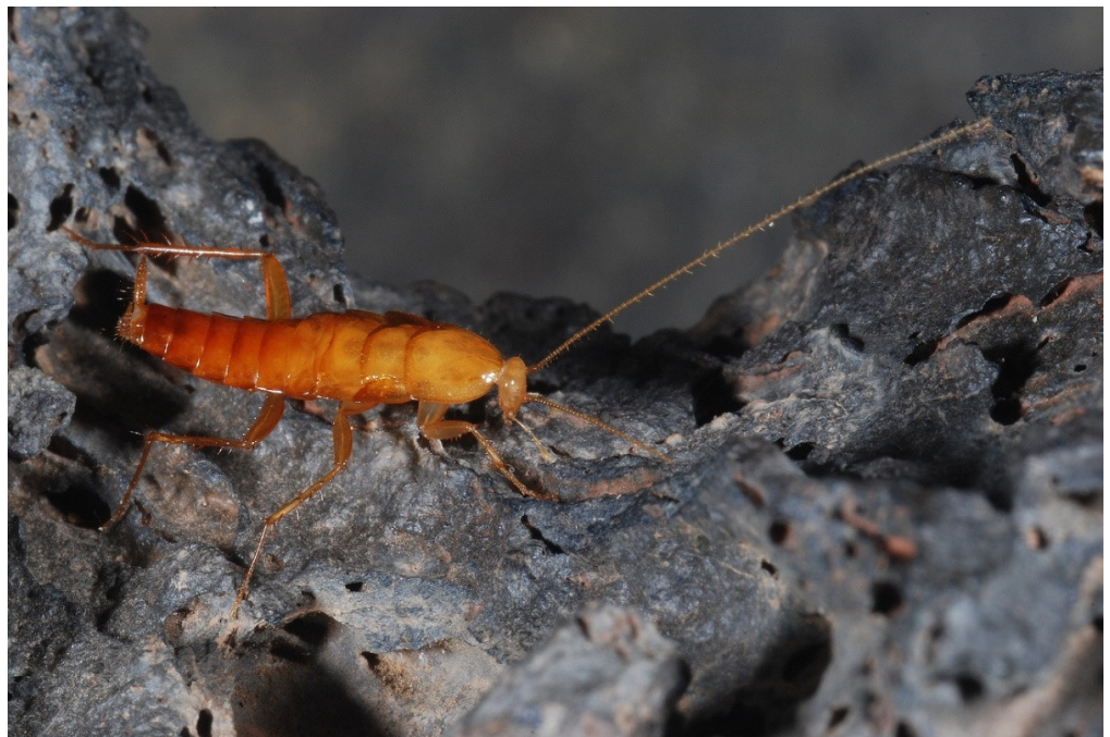
Figure 15. Male of Lobopecta troglobia , the most specialized cockroach occurring in many subterranean environments on the island.

All troglotrophic ground beetles are eyeless but otherwise not especially troglomorphic (Figure 18); Pterostichinae are medium size beetles in two endemic genera ( Wolltinerfia and Gietopus ), while Trechinae are smaller and are represented by the monospecific endemic genus Spelaeovulcania canariensis and two euedaphomorphic species of Lymnastis (Figure 19). The diversity of subterranean rove beetles is remarkable, both in the Canary Islands (27 spp.) and in Icod caves (6 spp.) [57], and they are usually more troglomorphic than ground beetles, as shown by the marked elongation of body and appendages in Domene alticola and D. vulcanica (Figure 20).