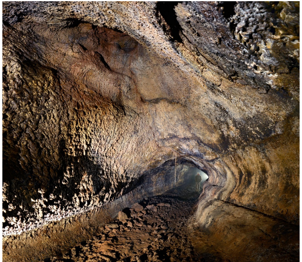
Figure 5. Ceiling with a closure suture of a formerly open lava channel, in Breveritas Gallery.