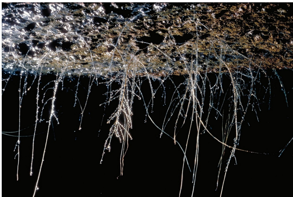
Figure 9. The tender roots hanging from the ceiling are an important input of organic matter.

Besides the main entrances, there are along both caves several partial collapses of the original compact ceiling, facilitating the connection with the overlying soil and sometimes even with the surface. This allows the entry by many troglonexes (animals not linked to the caves) and subtroglophiles (only linked for part of its life cycle) [41], which form an important resource for predatory species in many parts of the lava tubes, sometimes far from any large entrance. Abundant flying insects can be found in such spots, like the subtroglophile Megaselia scuttle flies that probably are common prey for a diversity of troglbiotic web-spiders, which could not survive only feeding on other troglbiotics. In the