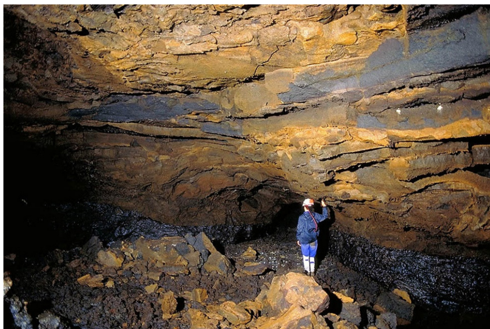
Figure 8. Large re-excavation of the ceiling and walls in the Ingleses Gallery, showing the parallel layers of the pahoehoe flow. Most of the fallen blocks that fell from the roof during the tube formation were swept away by the lava, while the latest to fall stayed in position on the floor.

The spectacular black band that can be seen along the main gallery of Ingleses must have been formed by a pulse of very fluid lava that flooded the conduit to a certain height (Figures 7 and 8). The rapid fall in the lava level left a thin layer that quickly cooled and vitrified in contact with the walls.