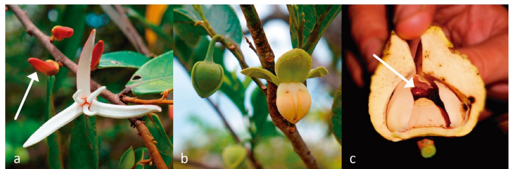
Figure 2. Flowers of three species of cantharophilous Annonaceae from our studies in the Cerrado of the Chapada dos Guimarães, MT, Brazil. Note that all three have light-colored perianths. (a) Xylopiya aromatica has a mixed pollination system in which both thrips (Thysanoptera) and beetles (Coleoptera) take part. Flower visitation occurs mostly during the day, although flowers remain anthetic throughout the night. The adaxial surface of the outer petals and the linear inner petals are white. The abaxial surface of the outer petals, however, is of a vivid hue of red (arrow). (b) The calyx of Cardiopetalum calophyllum is light green, and the petals are light yellow. Flower visitation by nitidulids is diuturnal. (c) In this figure, it is possible to visualize the floral chamber of Annona crassiflora , delimited by the light yellow corolla. Pollinated by large nocturnal Cyclocephala scarabs (arrow), this species has large, thermogenic floral chambers. Note that the beetle shown inside has its head positioned toward the base of the inner petals, where the nutritious tissue patch is located.

In this same hectare, Gottsberger and Silberbauer-Gottsberger (2006) [66] showed that 92% of plant species flowered during the day, 6% were nocturnal, and 2% apparently attracted animals on a diuturnal basis. For the six sampled Annonaceae in the area, the trend inverted: most (four species) were nocturnal, and two species had diurnal anthesis. All Annonaceae were pollinated by beetles, with the exception of Xylopiya aromatica (Lam.) Mart. (Figure 2a), which was mainly pollinated by Thysanoptera and, secondarily, by beetles. The corollas of Annonaceae species, except D. furfuracea , whose corolla is reddish, are light in color (yellow, creamy, and white). Annonaceae specialization to cantharophily is also noteworthy when, for all plants in the area, their pollinating agents are considered functional groups (i.e., large bees, wasps, small bees, and flies). Whereas 70% of the local plant species were pollinated by more than one group of animals (generalists), only one Annonaceae species, Xylopiya aromatica (Figure 2a), was pollinated by more than one functional group (small beetles and thrips).