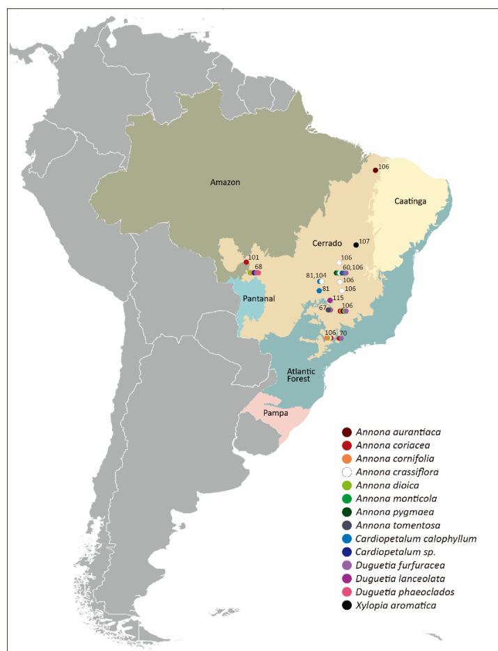
Figure 1. Brazilian biomes with Cerrado localities (circles) indicating Annonaceae study sites based on georeferenced published datasets. Circle colors refer to species, numbers to references cited. For further information, see Table 1.

Web of Science, ResearchGate, Academia.edu, Scielo) by applying combinations of search keywords (pollination, beetle, Coleoptera, Annonaceae, Cerrado ). Since a considerable part of the studies on this topic are in Portuguese, search keywords in Portuguese were applied in separate checks. References of cited publications were also checked for related topics. The complexity and interdisciplinarity of pollination biology rendered a necessary search for studies that do not directly address cantharophily, but still contribute to its understanding such as investigations on conservation and animal behavior. A geographical overview of literature-based Cerrado study sites is shown in Figure 1.