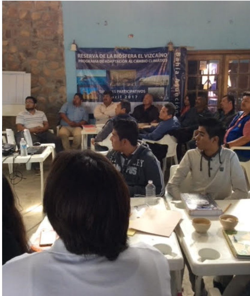
Figure S1. Participants in PCW during the discussion. Author: Antonina Ivanova