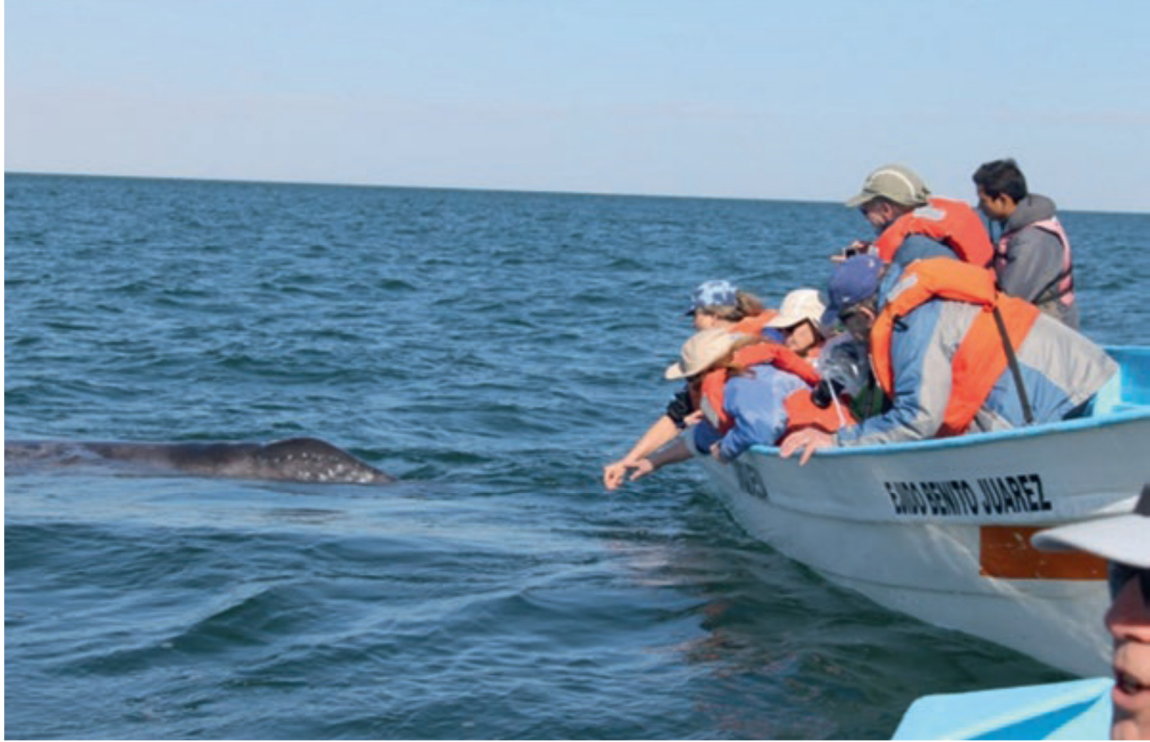
Figure S3. Whale watching in REBIVI. Author: Ekaterine Ramírez