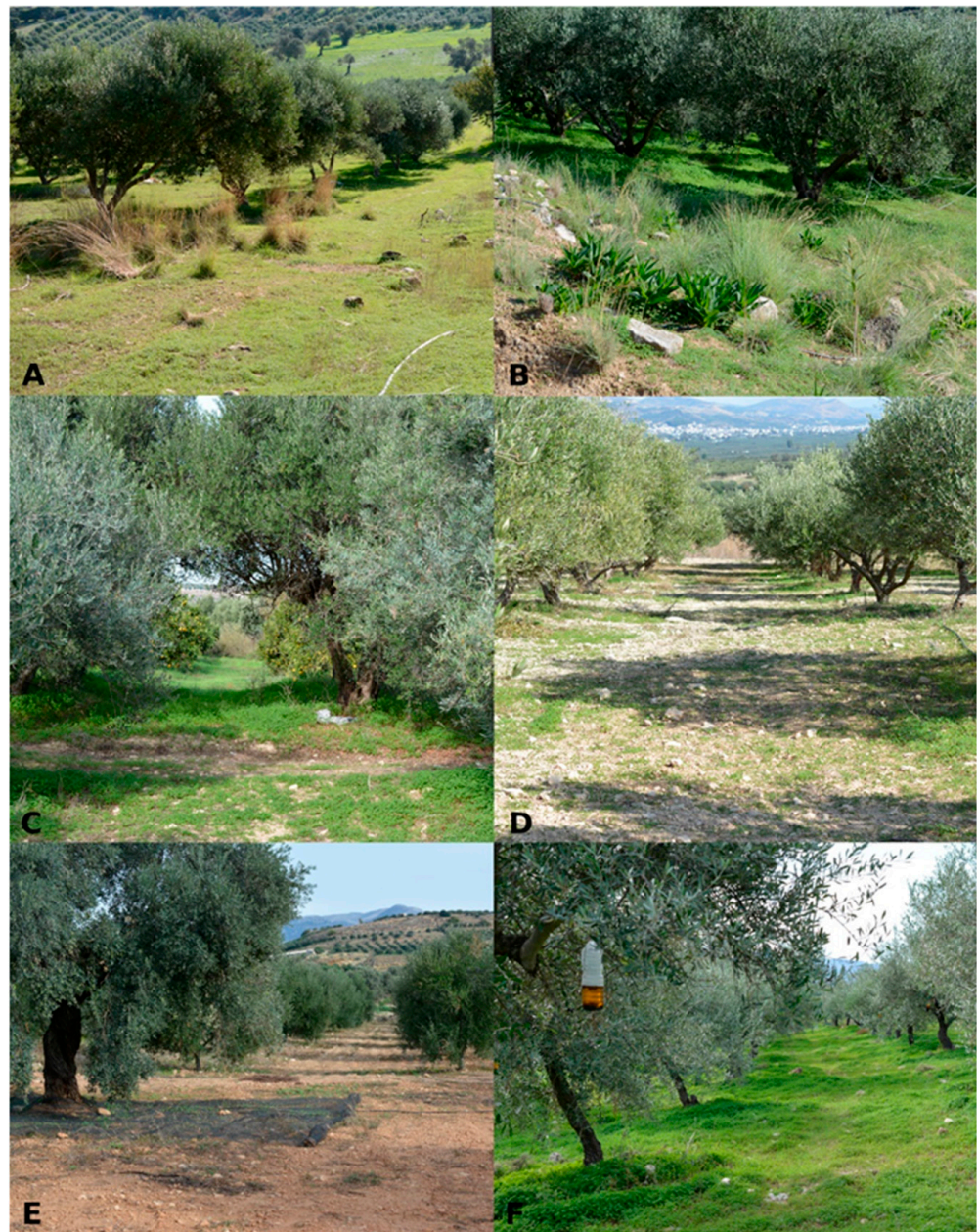
Figure 2. Photos of some of the olive orchards under investigation (numbering follows Table 1). (A) olive orchard 2o. (B) olive orchard 3o. (C) olive orchard 5o. (D) olive orchard 5c. (E) olive orchard 11c. (F) olive orchard 11o.

We counted 37 species, three (3) subspecies and two (2) undescribed species during the bibliographic research distributed in the four UTM grid cells (Table S1). 16 of 37 species (43%) are also present in the orchards. Two species found in the olive orchards, i.e., Caracolina lenticula (Michaud, 1831) and Xerotricha conspurcata (Draparnaud, 1801) (Figure 3A,B), are recorded for the first time in the study area.