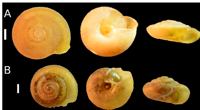
Figure 3. (A) Caracollina lenticula (Michaud, 1831), (B) Xerotricha conspurcata (Draparnaud, 1801). Scales bars correspond to 1 mm.