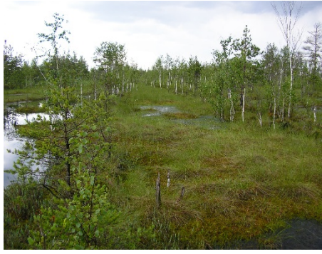
2005. Edge with Pinus sylvestris – Vaccinium uliginosum + Eriophorum vaginatum and Sphagnum carpet with Eriophorum vaginatum – Sphagnum fallax