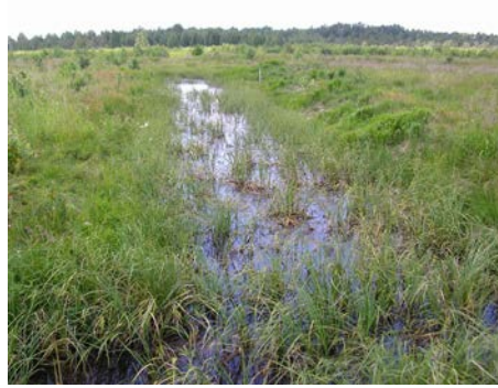
2005. Carex rostrata + Juncus filiformis