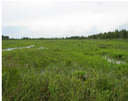
2008. Pool with Alisma plantago-aquatica + Scirpus sylvaticus ; Betula pubescens – Juncus conglomeratus + Calamagrostis epigejos