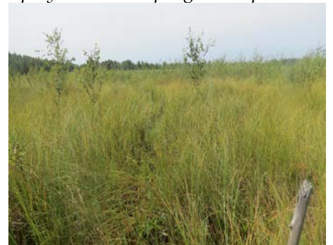
2021. Carex rostrata – Sphagnum fallax