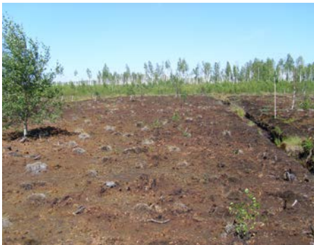
2007. After the wildfire in 2007.