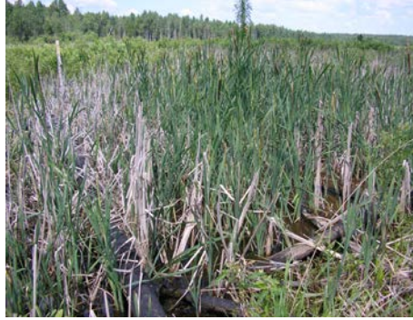
2005. Typha latifolia