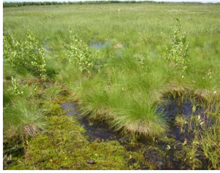
2005. Bare burnt peat and Betula pubescens – Eriophorum vaginatum