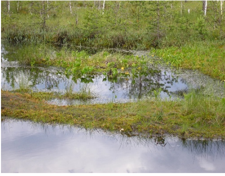
2005. Sphagnum carpet with Eriophorum vaginatum – Sphagnum fallax , in the background Eriophorum polystachion + Calla palustris – Sphagnum fallax