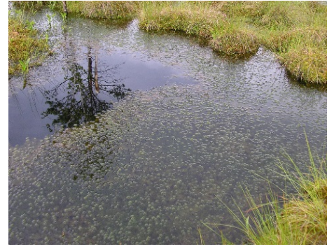
2005. Pool with Sphagnum cuspidatum