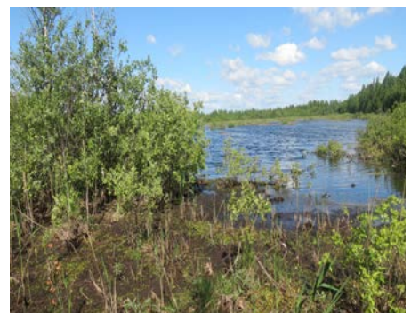
2018. General view