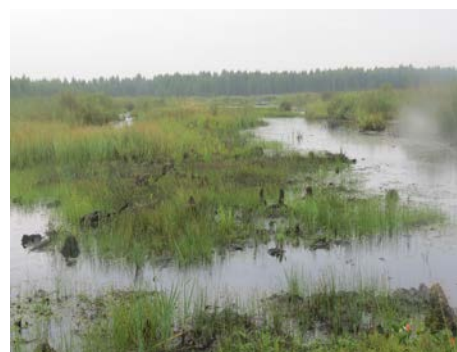
2021. General view