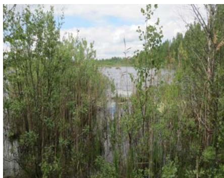
2017. General view