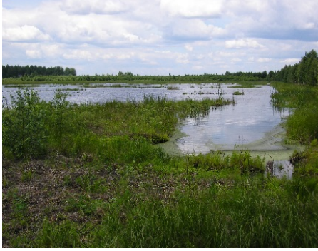
2005. General view