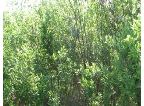
2011. General view