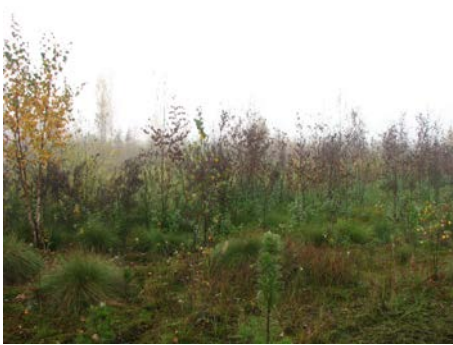
2007. After wildfire