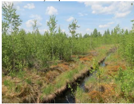
2016. General view