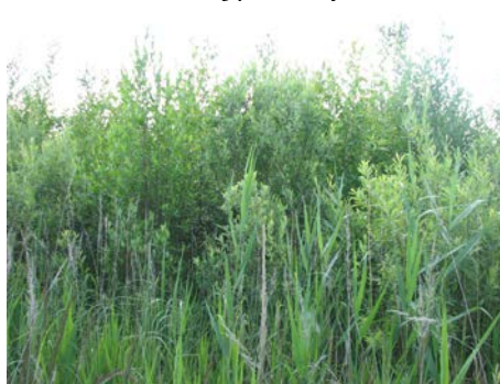
2009. General view