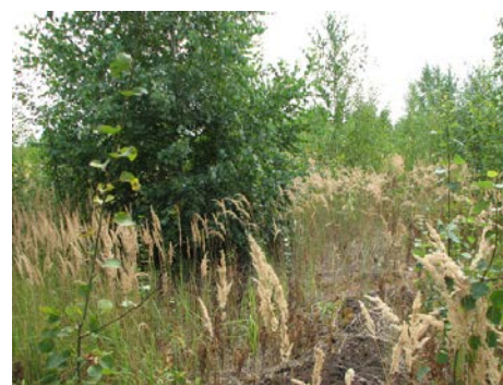
2012. General view