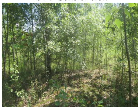
2018. General view