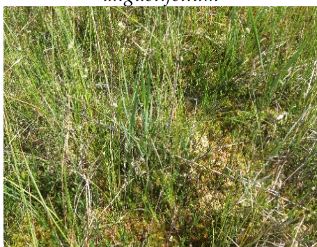
2018. Chamaedaphne calyculata – Phragmites australis – Sphagnum fallax