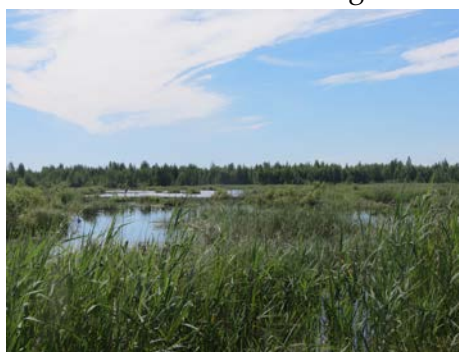
2016. General view