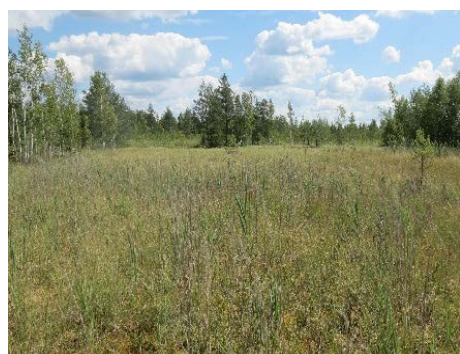
2017. General view