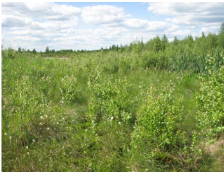
2009. Plant community with Eriophorum vaginatum