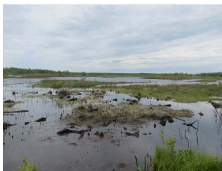
2018. General view