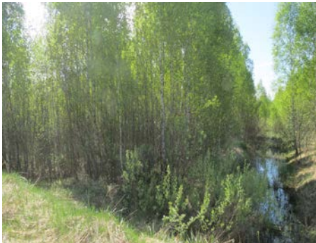
2018. Channel with Comarum palustre + Carex rostrata