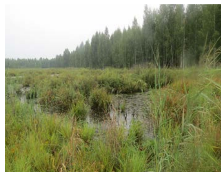
2021. General view