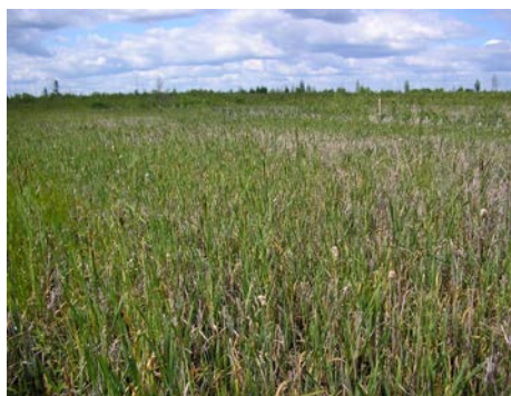
2005. General view