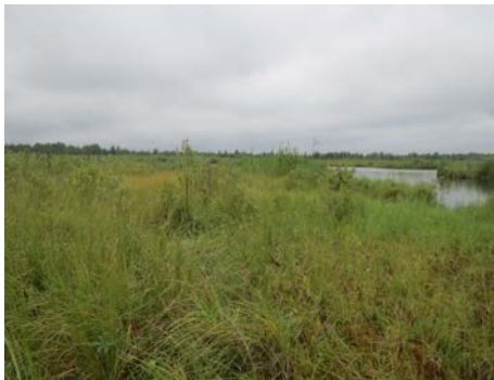
2016. Carex rostrata – Sphagnum fallax