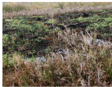
2007. After grass wildfire