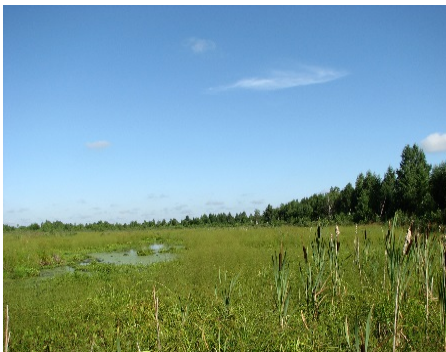
2009. Scirpus sylvaticus – Bidens tripartita and quack mire with Typha latifolia