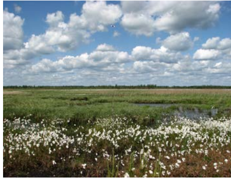
2009. Eriophorum polystachion - Polytrichum juniperinum