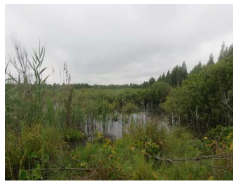
2016. General view