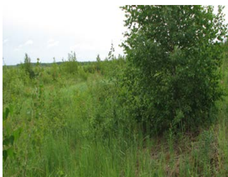
2011. General view