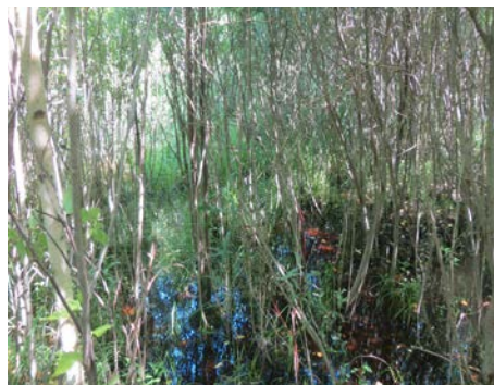
2017. General view