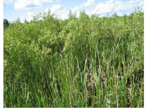
2008. General view