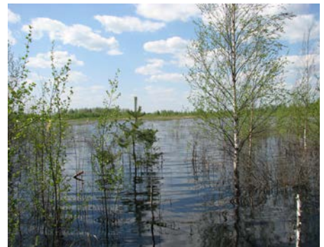
2012. Pool with single plants