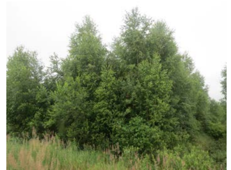
2016. General view