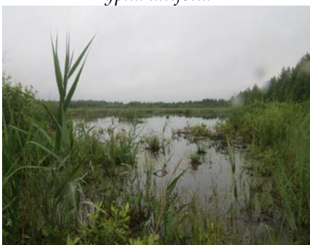
2016. General view