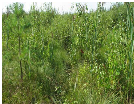
2011. Betula pubescens – Eriophorum vaginatum – Polytrichum juniperinum