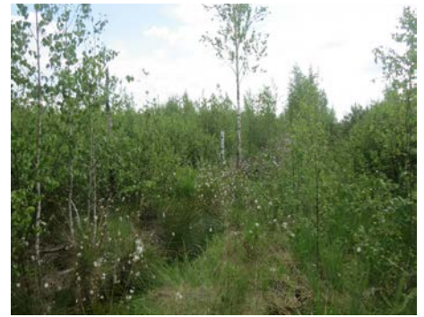
2016. Betula pubescens – Vaccinium uliginosum – Polytrichum juniperinum