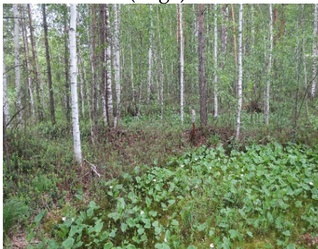
2018. Calla palustris – Sphagnum riparium (quarry) and Pinus sylvestris – Vaccinium vitis-idaea (edge)