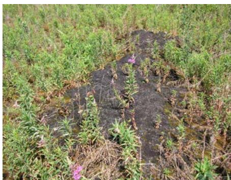
2005. Bare peat fragment