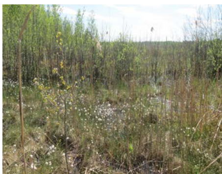
2018. General view