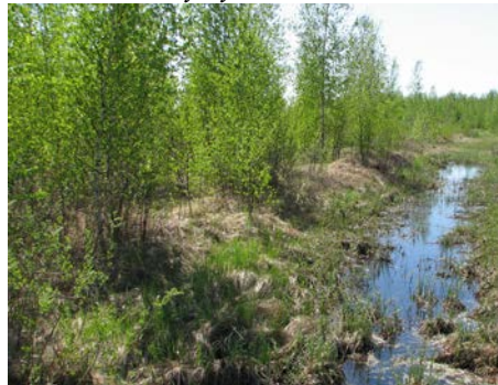
2011. Carex rostrata + Comarum palustre