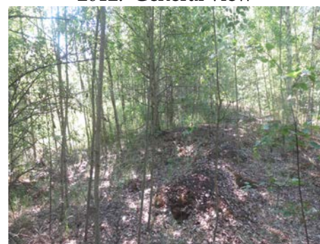
2021. General view