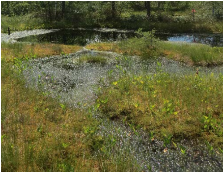
2017. Growth of the floating mat