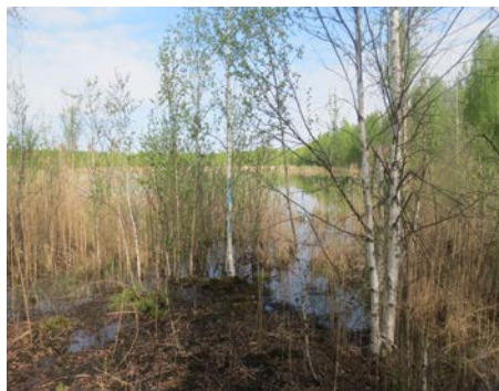
2021. General view