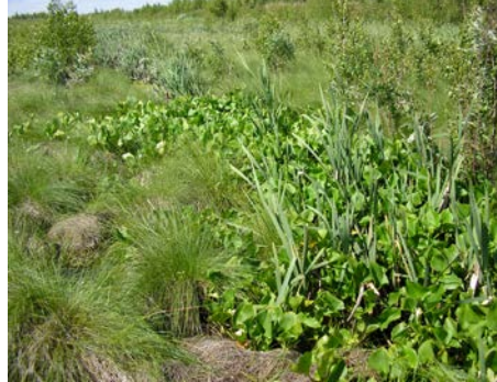
2005. Plant communities: Calla palustris – Typha latifolia (in the center), Eriophorum vaginatum (left), Betula pubescens – Eriophorum vaginatum