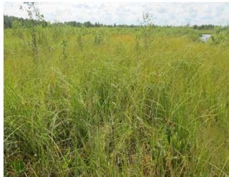
2017. Carex rostrata – Sphagnum fallax + Sphagnum riparium