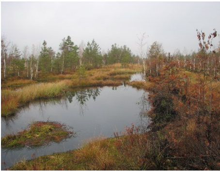
2007. Edge after the wildfire