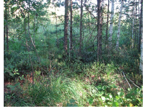
2012. Pinus sylvestris – Vaccinium vitis-idaea (edge)