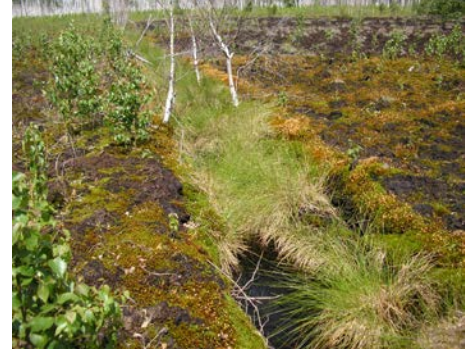
2005. Community with Eriophorum vaginatum (ditch)