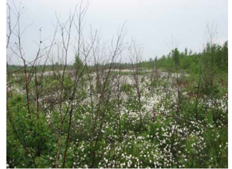
2008. Plant community with Eriophorum vaginatum