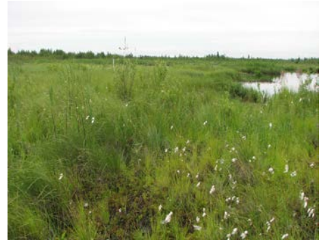
2011. Carex rostrata – Sphagnum cuspidatum u Eriophorum polystachion - Sphagnum riparium