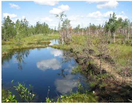
2008. Burnt edge and the pool