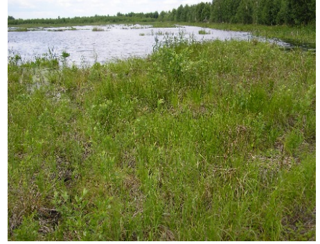
2005. Salix cinerea + Salix myrtilloides – Calamagrostis neglecta + Lycopus europaeus