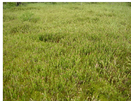
2005. Chamaedaphne calyculata – Sphagnum fallax