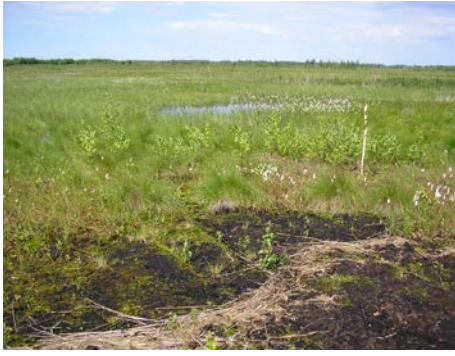
2005. General view with the plot