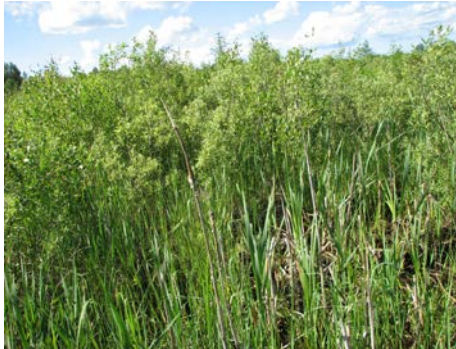
2008. General view