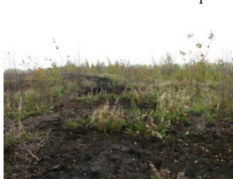
2007. After wildfire