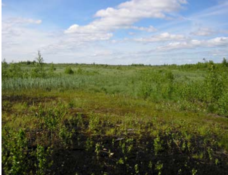
2005. General view of the milling field with the plot