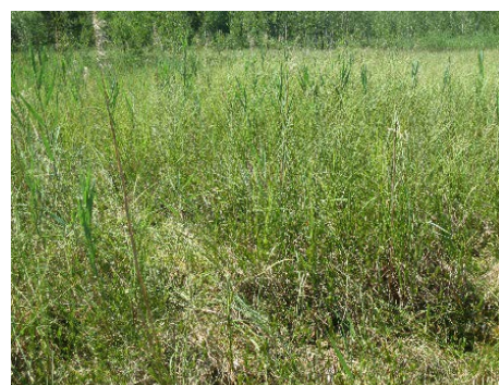
2021. Chamaedaphne calyculata – Phragmites australis – Sphagnum fallax