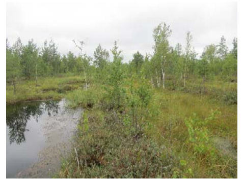
2016. Revegetation of the burnt edge