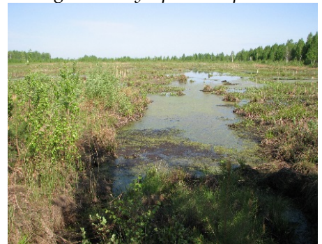
2009. General view