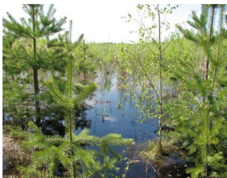
2012. After rewetting