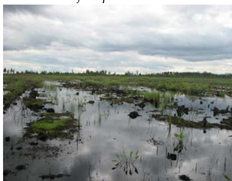
2009. General view