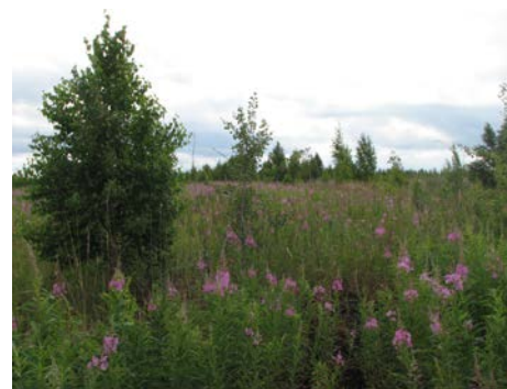
2009. General view