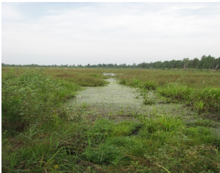
2008. General view