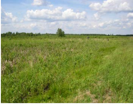
2005. General view