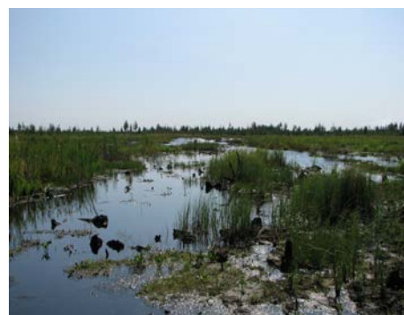
2011. General view