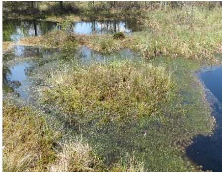
2018. Overgrowth of the pool with Sphagnum cuspidatum