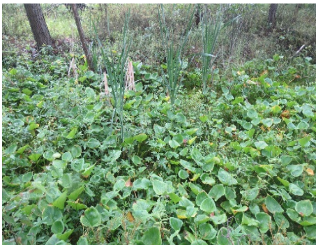
2016. Calla palustris – Sphagnum riparium