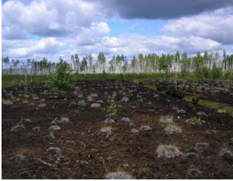
2005. Bare burnt peat with remains of cotton-grass tussocks