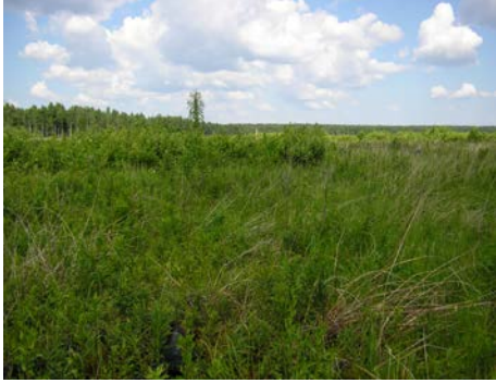
2005. General view