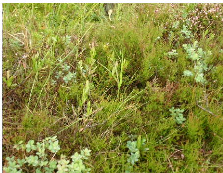
2005. Vaccinium uliginosum + Calluna vulgaris – Sphagnum angustifolium