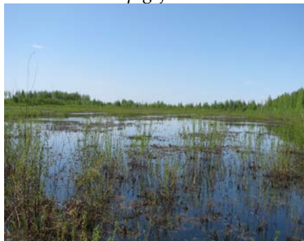
2011. General view after rewetting (spring)