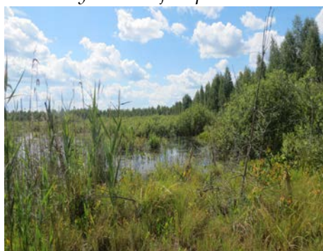
2017. General view