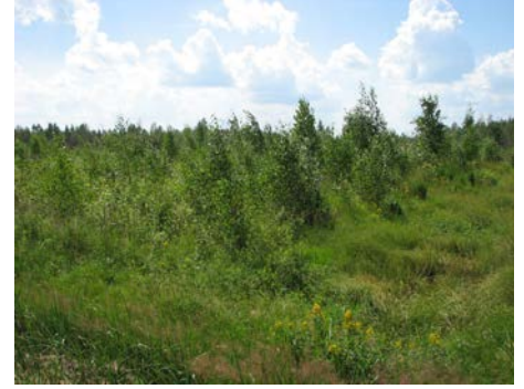
2008. General view