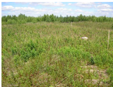
2005. General view with the plot