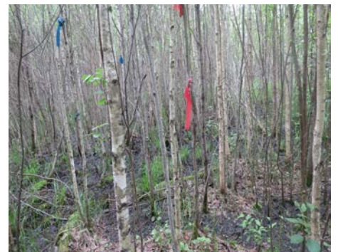
2021. General view