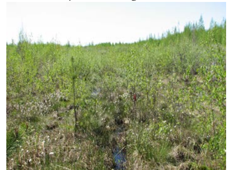
2011. Plant community with Eriophorum vaginatum