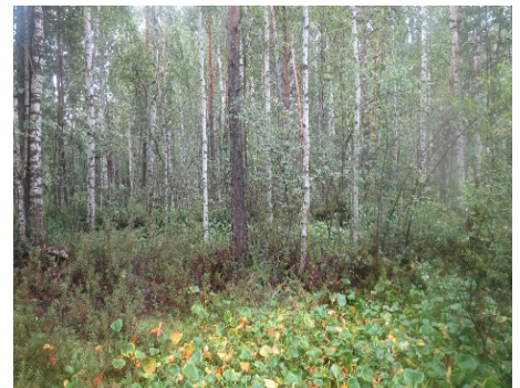
2021. Calla palustris – Sphagnum riparium (quarry) and Pinus sylvestris – Vaccinium vitis-idaea (edge)