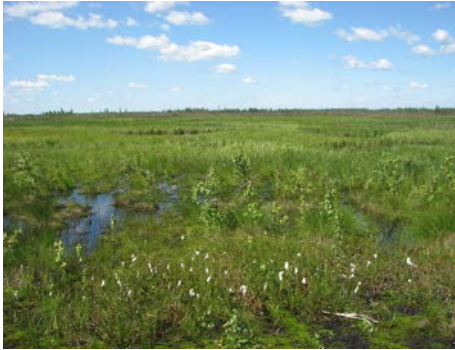
2008. General view