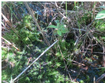
2021. Sphagnum mosses in coastal zone