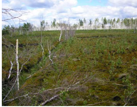
2005. Post-pyrogenic community Betula pubescens – Eriophorum vaginatum – Polytrichum juniperinum