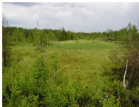
2005. General view