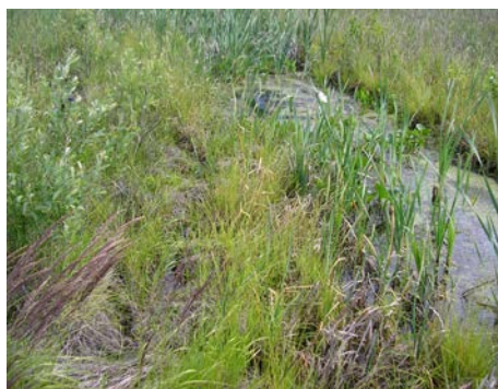
2005. Salix cinerea – Carex cinerea Betula pubescens – Polytrichum juniperinum