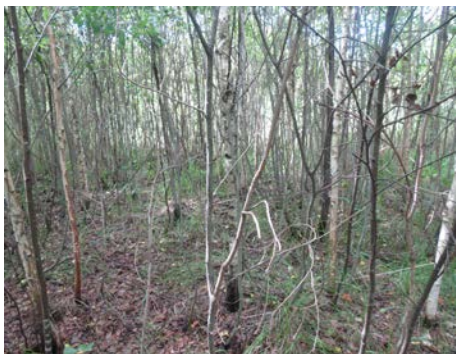
2016. General view