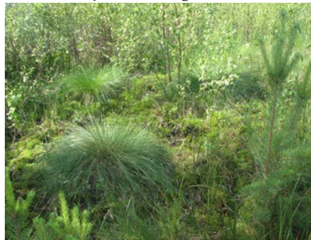
2010. Betula pubescens – Eriophorum vaginatum – Polytrichum juniperinum