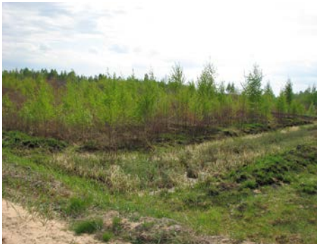
2009. After wildfire in spring