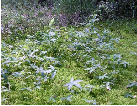
2005. Comarum palustre – Sphagnum riparium