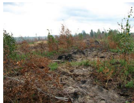
2007. After wildfire