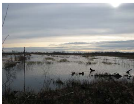
2008. After rewetting