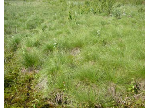
2005. Plant community with Eriophorum vaginatum