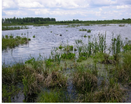
2005. Pool with single plants