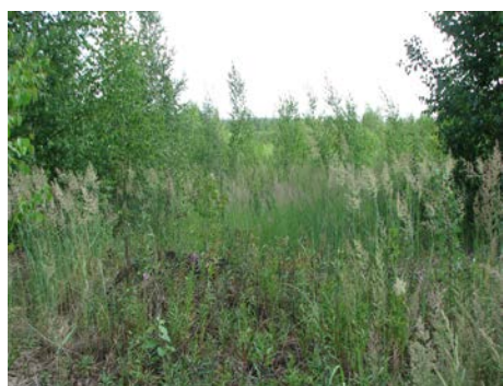
2010. General view