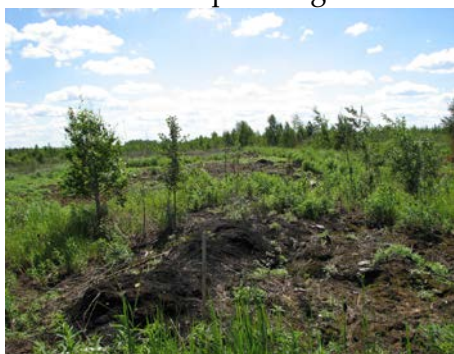
2008. Fragment of bare burnt peat