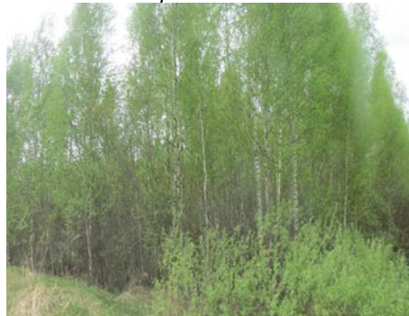
2021. General view