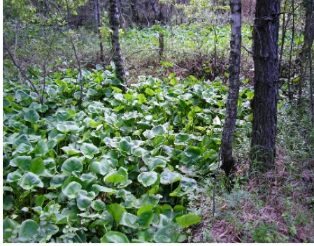
2005. Calla palustris – Sphagnum riparium (quarry) and Pinus sylvestris – Vaccinium vitis-idaea (edge)