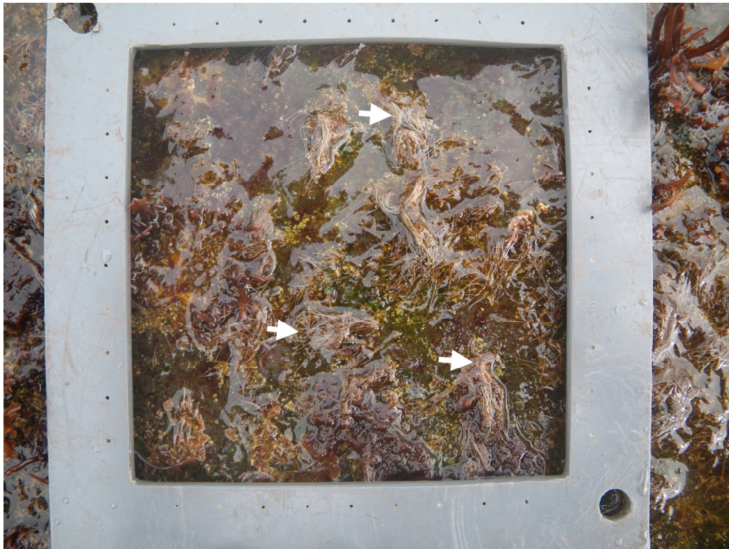
Figure 2. Close-up view of the mid-intertidal substrate featured in Figure 1b showing numerous byssal threads (examples are indicated by arrows) as the only remains of mussels on 29 September 2023, shortly after the passage of cyclone Lee. The inner frame of the PVC quadrat measures 10 cm × 10 cm.

Funding: This study was funded by a Discovery Grant (#311624) awarded by the Natural Sciences and Engineering Research Council of Canada (NSERC) to the author.