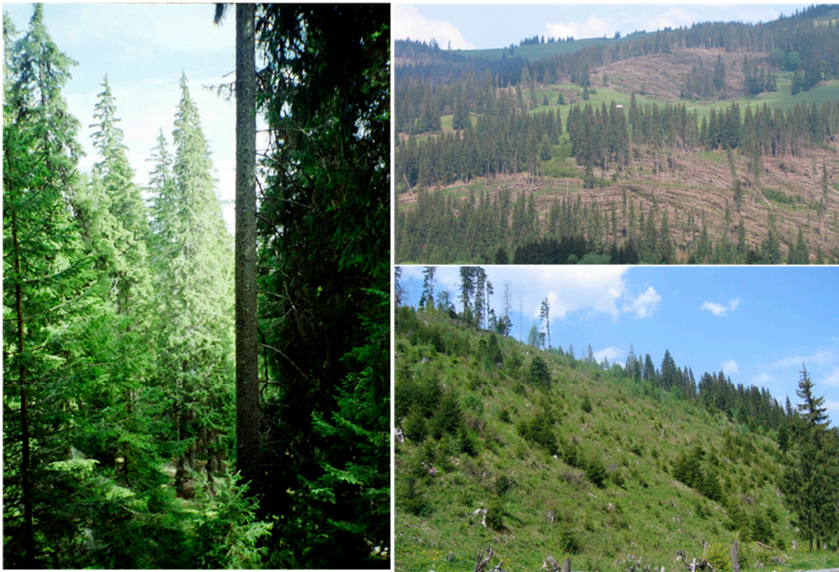
Figure S5. Dynamics between the coniferous forest and areas with shrubby vegetation following the action of climate risk factors in the upper Bistrița basin.