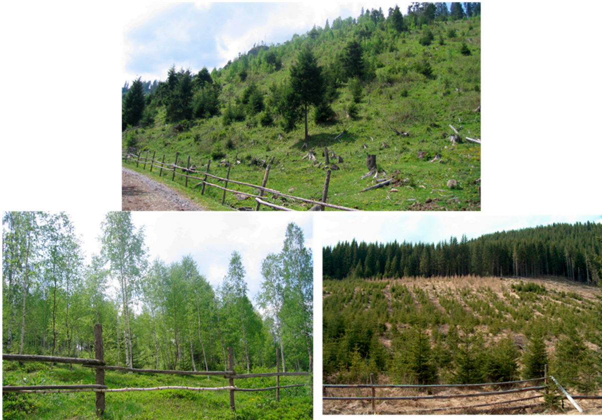
Figure S2. Changes in the opposite direction of areas with shrub vegetation towards forest through natural or artificial regeneration in the upper Bistrita basin