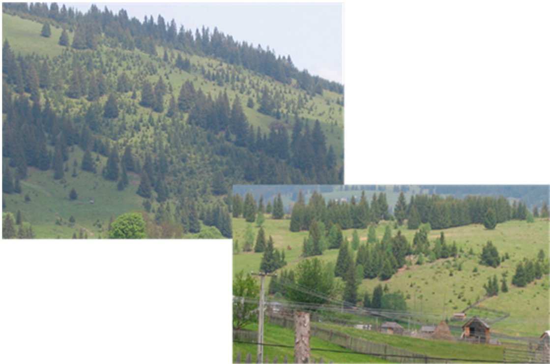
Figure S4. Change in land cover from pasture/natural meadow to forest determined by the abandonment of agricultural activities in the mountain area