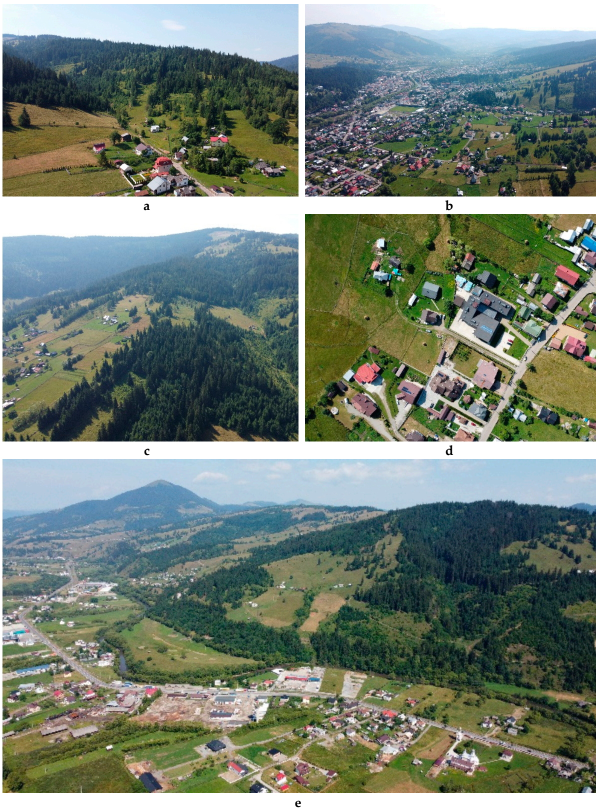
Figure S1. Dynamics between antropic and natural areas with shrubby vegetation and grassland in the upper Bistrita basin (a,b,c,d,e).