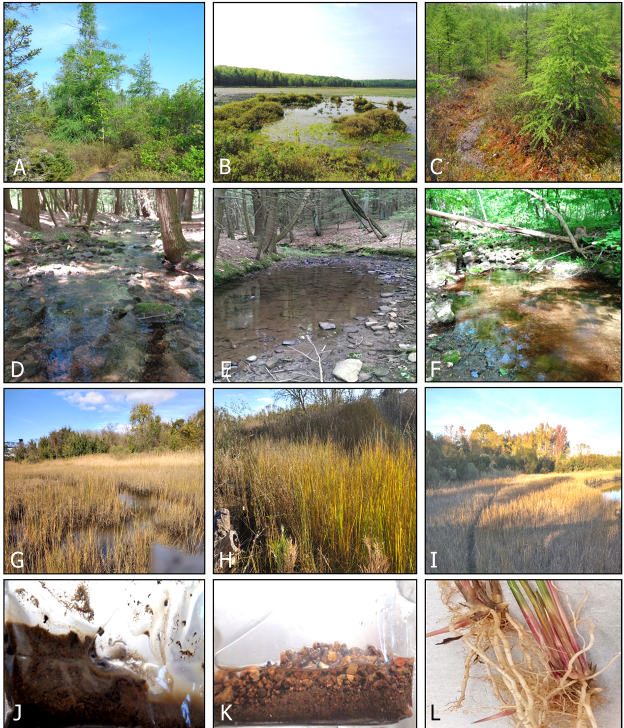
Figure S1. Sampling sites and samples. A) Tannersville Cranberry bog B) Black Moshannon State Park C) Beulah bog D) Nescopeck State Park E) Pepper Run F) Honey Creek Natural Area G) Republic H) Bell Mills I) Deep Creek Lock J) detritus sample K) stream bed sample L) roots.