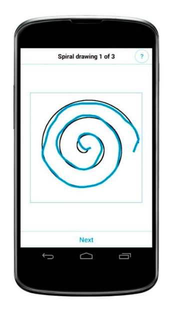
Figure 1. Implementation of a fine motor test (spiral drawing) on the smartphone.

out, using the dominant hand. The drawing was repeated three times per test occasion. The total number of occasions with the smartphone for PD patients was 240, and for healthy controls it was 176.