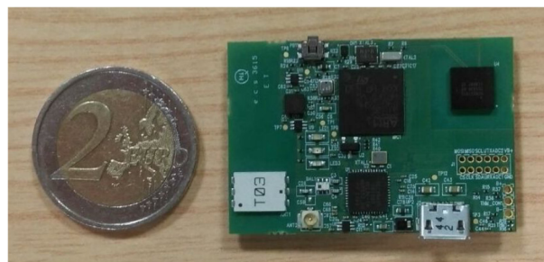
Figure 2. Hardware platform used for data collection.