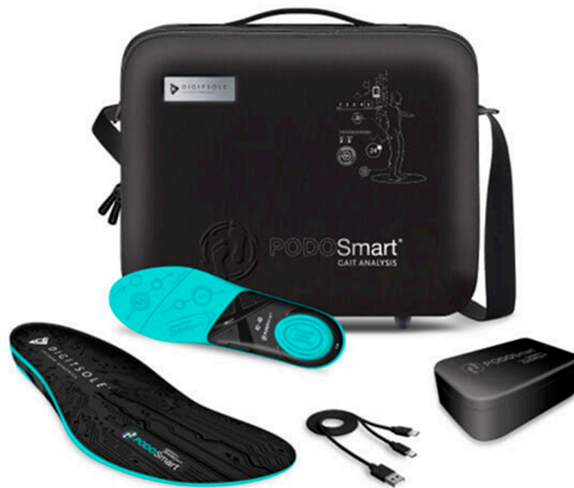
Figure 1. PODOSmart® insole device.