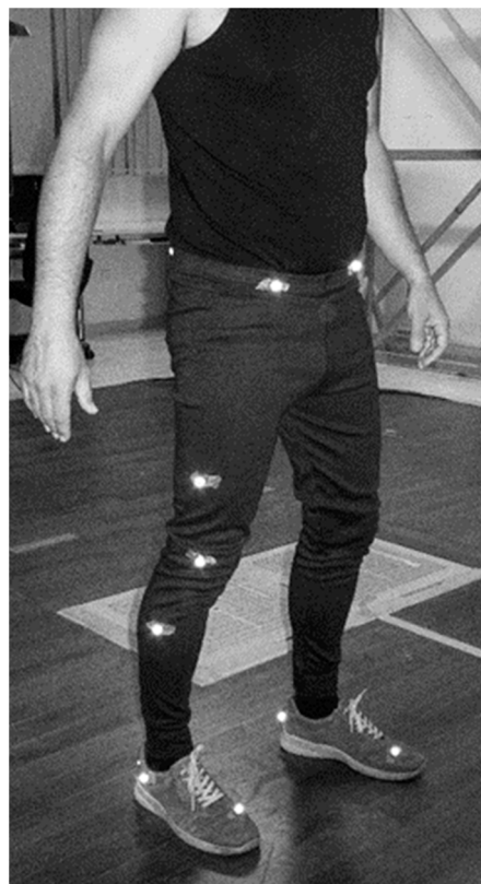
Figure 3. Vicon markers set configuration on subject.

Gait analyses were conducted in the “Laboratory of Motor Behavior and Adapted Physical Activity” at the Department of Physical Education and Sport Science of the Aristotle University of Thessaloniki. Participants wore their preferred walking shoes, tight t-shirt, and tights or tight shorts. The PODOSmart ® insoles fitted into participant’s shoes and 16 reflective markers of the Vicon system were bilaterally attached to specific anatomic points of the participants’ lower limbs according to the lower body plug-in-gait model enabling three-dimensional analysis of lower body movements during gait (Figure 3) [32]. A 6 m walkway was used for the analysis. The Vicon system cameras were positioned around the walkway and were calibrated to the walkway using standardized protocols recommended by the manufacturer at the beginning of each capturing session.