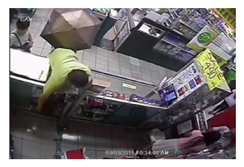
Figure 3. Sample frame from the UCF crimes shoplifting video dataset.

The work of Finklea [17] found that in cases of organized retail crime, often individuals will work in a group, with one or more individuals acting as a lookout for security staff surveillance cameras and other customers. Furthermore, these accomplices will often create diversions or distract store employees. A clear example can be found in the video frame in Figure 3, taken from the UCF crimes dataset [18]. In this real-life example, there are four individuals involved with the shoplifting attempt. One individual on the right is talking to and distracting the shop assistant; a second individual is standing in front with an umbrella raised to hide the attempt from other shoppers. A third individual stands to the left with an open bag ready to conceal the items. This helps to demonstrate the lengths that organized criminals will go to avoid detection.