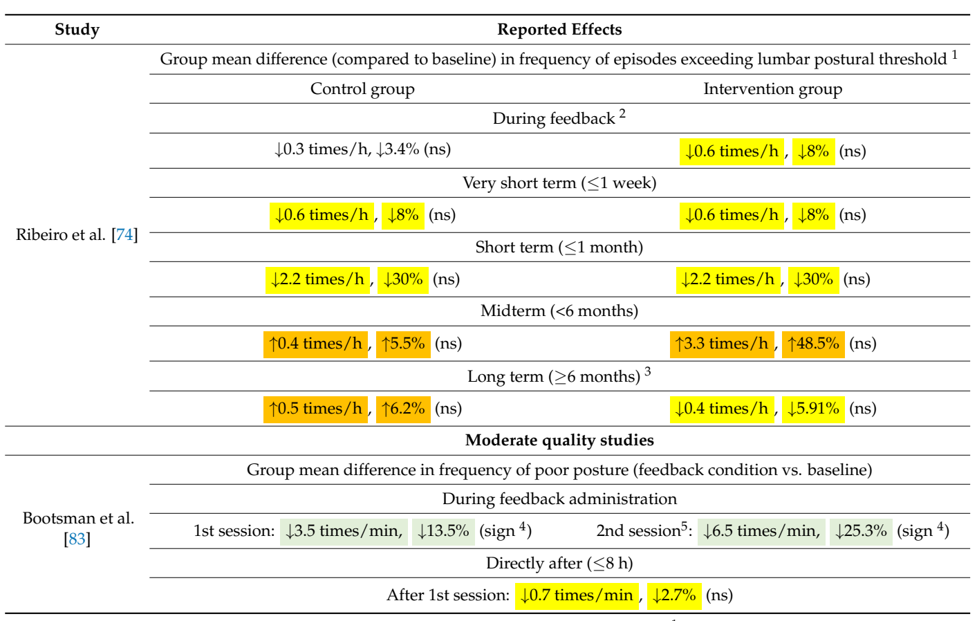
Table 12. Cont.

Notes: ns: not statistically significant; sign: statistically significant; <sup>1</sup> statistical test refers to the difference between the control group and the intervention group; <sup>2</sup> average of weeks 1–4; <sup>3</sup> averages of 6-month and 12-month follow-up; <sup>4</sup> significance level not reported; <sup>5</sup> Included is also visual feedback combined with note-taking.