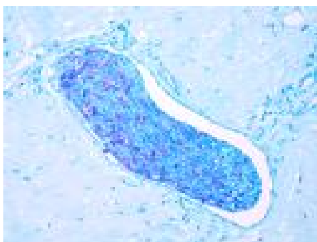
Fig. 3. Immunohistological examination shows a massive invasion of melanoma cells into the lumina of a vessel without any adjacent immunological response (HMB45, original magnification \times 200 )