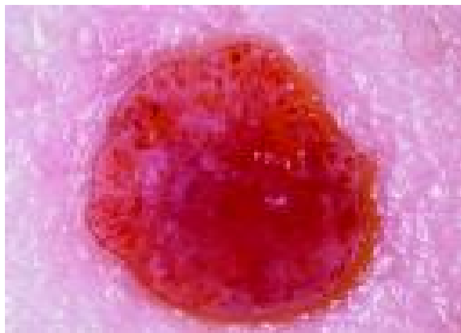
Fig. 1. Under the dermatoscope, the polymorphous vascular pattern with horizontally oriented truncated capillaries, vascular red globules, and scar-like areas suggest amelanotic malignant melanoma