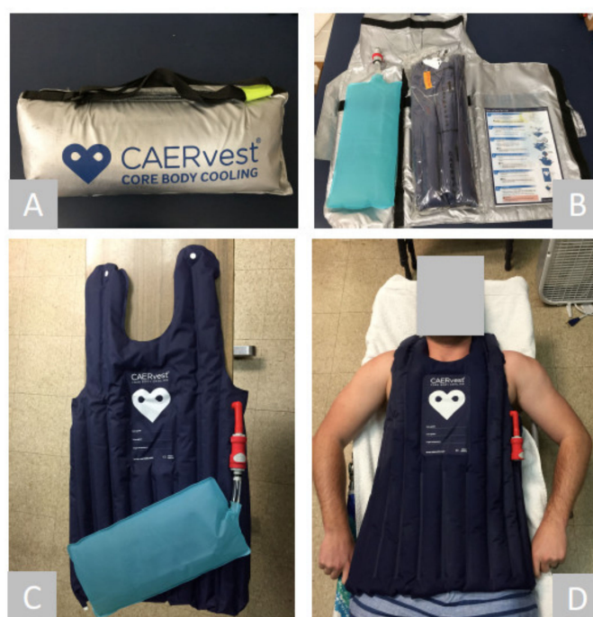
Figure 1. Overview of CAERvest ® cooling vest. (A) Exterior packaging. (B) Contents of packaging. (C) CAERvest ® being activated using a water reservoir attachment. (D) Participant being cooled.

Upon cessation of exercise, participants removed their T-shirt and shoes, and the cooling portion of the testing session began. The cooling intervention for both conditions took place within the climate-controlled chamber to replicate the scenario of pre-hospital care (i.e., providing the care onsite in the heat). In the VEST condition, participants laid supine on a cot, while CAERvest ® was activated using an external water reservoir kept at room temperature (3000 mL), which triggers the chemicals inside the vest resulting in a cooled vest surface (Figure 1C). The dimension of vest was 730 mm by 820 mm, and covered the ventral side of torso from shoulder to hip (Figure 1D). After each trial, the vest was discarded. During the PASS condition, participants sat in a standard chair. Cooling in VEST and PASS conditions continued until T_{RE} reached 38.25 °C.