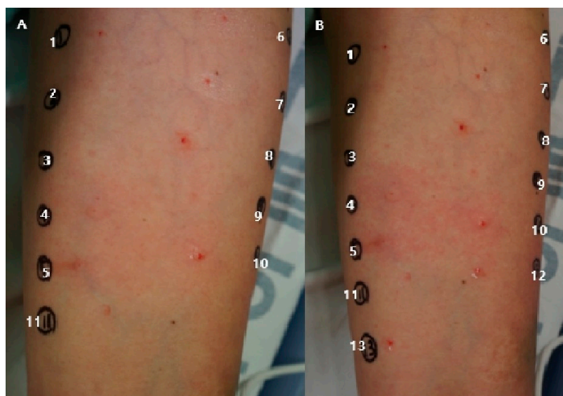
Figure 2. Results of the skin prick test in 5 (A) and 30 min (B).

The intradermal test was not done because the skin test was positive. The surgery was re-planned two weeks after the event. Anesthesia was induced and maintained with propofol and remifentanil. After loss of consciousness, 10 mg of cisatracurium was administered for muscle relaxation. The patient’s vital signs were stable. The patient underwent surgery without any other adverse event and was discharged without any complications 7 days later. Written informed consent was obtained from the patient for the publication of this case report.