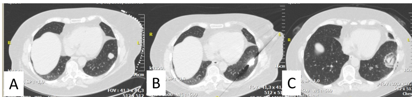
Figure 1. (A) 59 years-old female sarcoma patient with a solitary metastasis of the left lung; (B) CT-guided microwave ablation was performed; (C) Metastasis was completely ablated with safety margins (ground glass infiltrate).