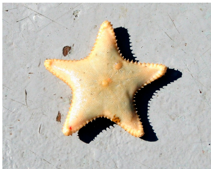
Figure 11. Ctenodiscus crispatus [69].

The starfish Ctenodiscus crispatus (Bruzelius, 1805) (Figure 11) is broadly distributed worldwide, especially on mud bottoms of northern coasts [68]. It has rounded short and large arms, the dorsal side is large, usually yellow-orange, while the ventral side is whitish. This starfish is characterized by the presence of vertical row of spikes and cilia along the edge of arms that form the so-called cribriform organ. This helps to increase the flow of oxygen rich water across the body when it is covered in the mud where the starfish live.