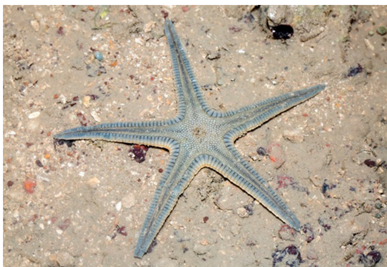
Figure 10. Craspidaster Hesperus [67].

Craspidaster hesperus (Muller & Troschel, 1840) (Figure 10) is distributed in the Indo-West Pacific Ocean. It is a flat sea star with five elegant tapered arms. The dorsal surface of its body presents special flat-topped, pillar-like structures, called paxillae. Large marginal plates characterize the body's edges and the tube feet are pointed [66].