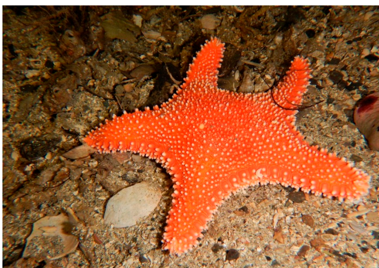
Figure 15. Hippasteria phrygiana [83].

Hippasteria represents a group of cold-water starfishes, typically coral/cnidarian predators. They are five-armed sea stars, characterized by a large and flattened central disc. Hippasteria phrygiana (Parelius, 1768 from World Register of Marine Species-WoRMS), also named H. kurilensis , is widely distributed in the oceans (Figure 15).