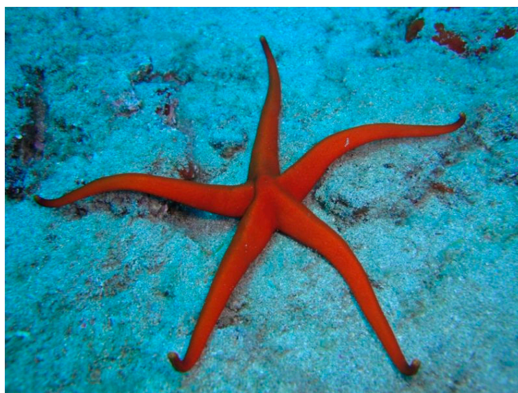
Figure 16. Narcissia canariensis [89].

The glycolipid fraction isolated from the starfish N. canariensis , containing particular glycosphingolipids named ophidiacerebrosides, was evaluated for its cytotoxic activity against various human cancer cell lines from multiple myeloma, colorectal adenocarcinoma and glioblastoma multiforme by Farokhi [90]. The results demonstrated that the fraction (F13-3) displayed an interesting cytotoxic activity over 24 h.