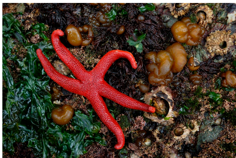
Figure 14. Henricia leviuscula [81].

Henricia leviuscula (Stimpson, 1857), commonly known as the Pacific blood star, is a starfish that habits the Pacific coast of North America. It has a brilliant red-orange color and five, long, tapering arms, characterized by the absence of pedicellariae and spines (Figure 14).