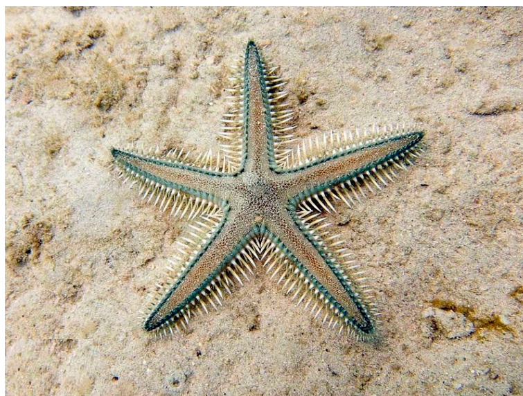
Figure 7. Astropecten polyacanthus [52].

The genus Astropecten includes a huge amount of species, very similar to each other, that inhabit sandy or muddy seabeds. One of them, Astropecten polyacanthus (Müller & Troschel, 1842) is commonly known as the Sand Sifting Starfish (Figure 7). It is an innocuous invertebrate, distributed in the Indo-Pacific Ocean. It possesses teeth or spine like structures running along the outer edges of its five arms, which help the sea star to conduct its benthic life, by moving, burrowing, and feeding.