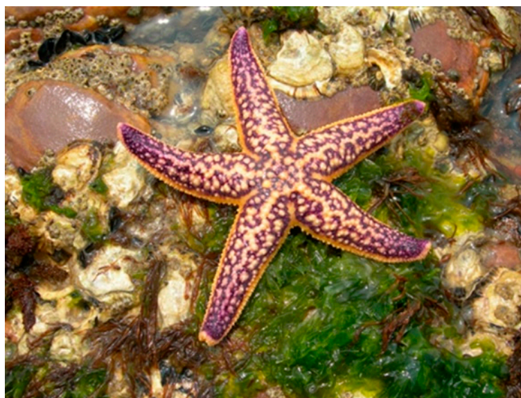
Figure 4. Asterias amurensis [34].

feet are found. This starfish is characterized by a variety of colours, ranging from orange to yellow, or sometimes purple on their dorsal side [33].