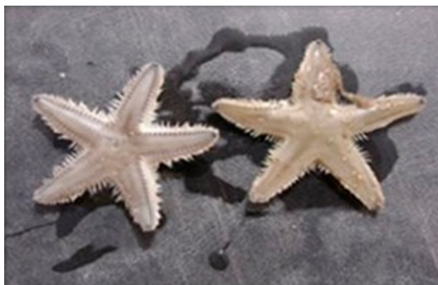
Figure 8. Astropecten monacanthus [55].

Thao et al. [56] in their study isolated six asterosaponins from A. monacanthus , whose structure and anti-inflammatory activity were elucidated in a previous work [57]. Both the whole extract and the isolated compounds were tested against three human cancer cell lines (HL-60, PC-3, SNU-C5) to check their cytotoxic potential. The results showed a potent cytotoxic activity of Astrosterioside D on all cell lines. Furthermore, the methanol extract exhibited a more potent cytotoxic activity compared to the isolated saponins. This suggested that the inhibitory activity could be due to the synergic effect of more than one compound. Further investigations clarified that the induction of apoptosis through the downregulation of PI3K/AKT and ERK 1/2 MAPK pathways is responsible of the cytotoxic activity.