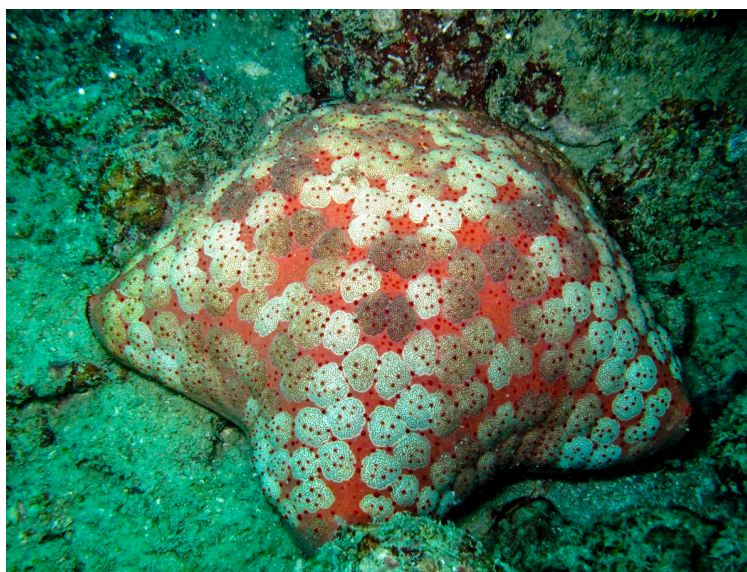
Figure 12. Culcita novaeguineae [71].

Two asterosaponins, named novaeguinosides I and II, together with a known saponin, regularoside B, were isolated from the starfish Culcita novaeguineae [72]. The cytotoxic activity of these compounds was tested, and the results showed a marginal effect against two human tumor cell lines (human leukemia K-562 cells and human hepatoma BEL-7402 cells).