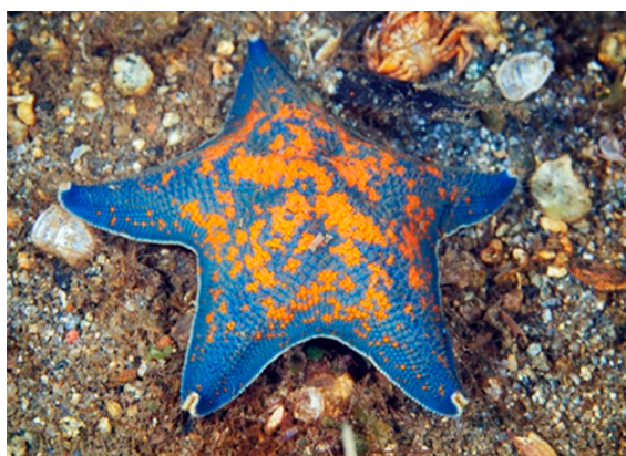
Figure 5. Asterina pectinifera [40].

Lou et al. [41] in their study tested the biological activity of a series of peptides derived from the motifs of cyclin B of A. pectinifera . Interestingly, the complex CDK1/cyclin B of this starfish, described by McGrath [42], showed a significant similarity with the human CDK2/cyclin A complex. Therefore, the authors investigated the biological potential of three selected motifs of cyclin B ( \alpha 5 helix, \alpha 3 helix and N-terminal, named a5, a3 and N respectively) on two human tumor cell lines, i.e., HCT-116 (human colon adenocarcinoma cells) and EC-9706 (esophageal carcinoma cells). To facilitate the cellular uptake of these peptides, they were conjugated with the protein transduction domain of HIV-1 transactivator of transcription (Tat). The results showed a significant cytotoxic activity of Tat-a5 in both cell lines, compared to the other peptides examined. Further investigations suggested that Tat-a5 compete with Cyclin B1 and bind to CDK1 preventing its excessive activation. As a consequence, cancer cells get arrested at G2/M phase and go toward apoptosis. These considerations suggest that the peptide Tat-a5 could be a novel relevant compound with anticancer and tumor angiogenesis-inhibiting activity.