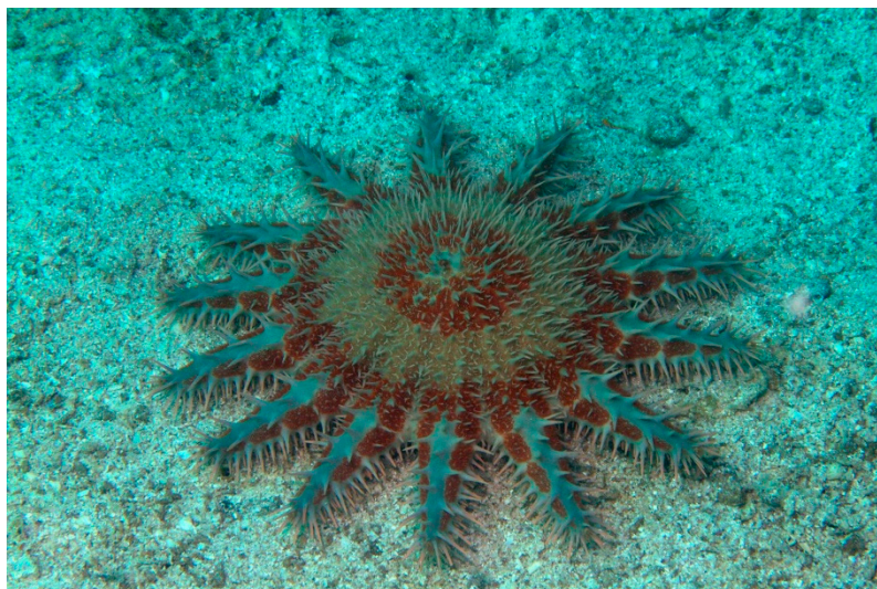
Figure 1. Acanthaster planci [19].

The starfish Acanthaster planci (Linnaeus, 1758) (Figure 1) lives in tropical waters of the Indian and Pacific Oceans. It is one of the largest starfishes, also known as “crown of thorns” because its body possesses numerous large, venomous spines [18]. Its colour varies from red and orange to purple and is thought that these variations could be the result of differences in diet.