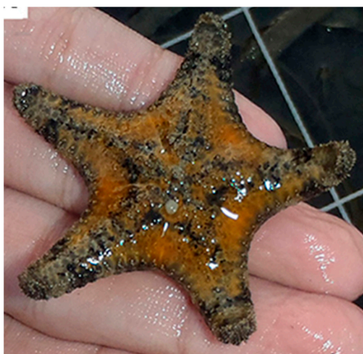
Figure 2. Anthenea aspera [28].

In a further study [14] the isolation of new steroidal glycosides from the starfish Anthenea aspera (Döderlein, 1915) was carried out (Figure 2), and their in vitro effects on colony formation, cell viability, and apoptosis promotion in three different types of human tumor cell lines, i.e., human melanoma RPMI-7951, breast adenocarcinoma T-47D and colorectal carcinoma HT-29, were evaluated. All the tested compounds showed inhibitory effect on colony formation at nontoxic concentration in the three cell lines. Furthermore, the mixture of two molecules (anthenosides J and K) showed a significant anticancer effect through the induction of apoptosis. Indeed, these compounds cause the downregulation of anti-apoptotic protein expression (Bcl-XL) and the up-regulation of the pro-apoptotic protein expression (Bax and Bak), leading to the activation of the initiator caspase-9 and, in turn, of the effector caspase-3.