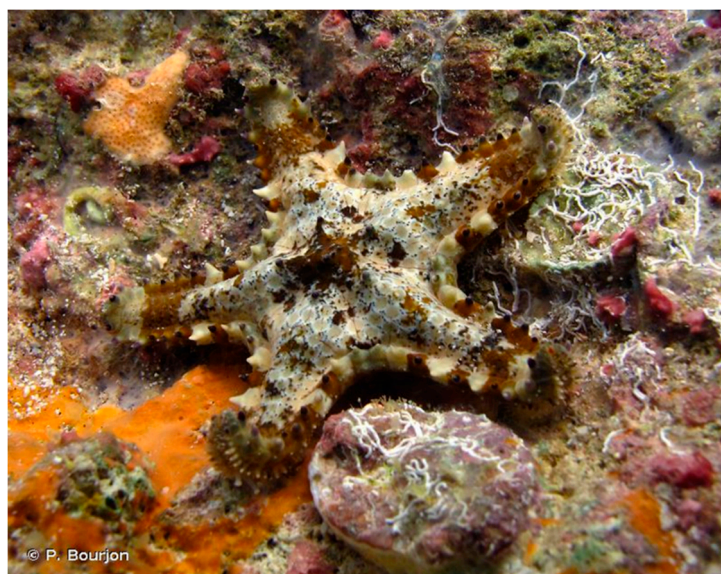
Figure 6. Asteropsis carinifera [49].

The starfish Asteropsis carinifera (Lamarck, 1816) is distributed in the Indo-Pacific area. It has five arms characterized by the presence of large conical and dull spines aligned in the middle and on the periphery of each arm. The body is relatively flat but slightly convex towards the middle of the central disk and the colour is usually gray with stained brown spots (Figure 6).