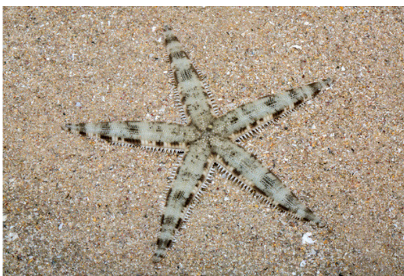
Figure 3. Archaster typicus [31].

Archaster typicus (Müller & Troschel, 1840) is distributed in the shallow waters of the Western Indian Ocean and the Indo-Pacific. Also known as a sand star, it has five long, slightly tapering arms with pointed tips [30]. It has usually a grey or brownish colour, variously marked with darker and lighter patches (Figure 3).