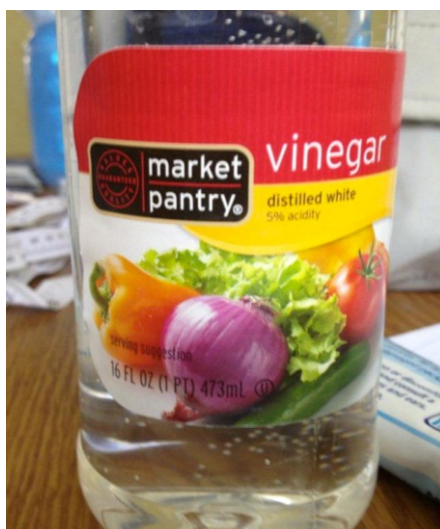
Figure 1. Inexpensive household vinegar used to perform the Visual Inspection with Acetic Acid (VIA) test.

from Emory University School of Medicine as part of a collaboration with the Haiti Medishare program. The patient had multiple complaints due to a lack of previous healthcare. We will focus this report mainly on her gynecological symptoms and the subsequent clinical examination that was performed, including the application of the VIA screening technique.