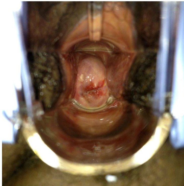
Figure 3. Visualization of cervix with acetic acid reveals white patches indicating cervical dysplasia.