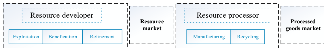
Figure 1. A genetic two-stage resource-based supply chain.

In the following sections, low-carbon and environmental remediation reflect the contributions and costs of each enterprise, low-carbon consumer preferences are incorporated to reflect market demand, and we apply game theory to analyze total profit across the whole resource-based supply chain.