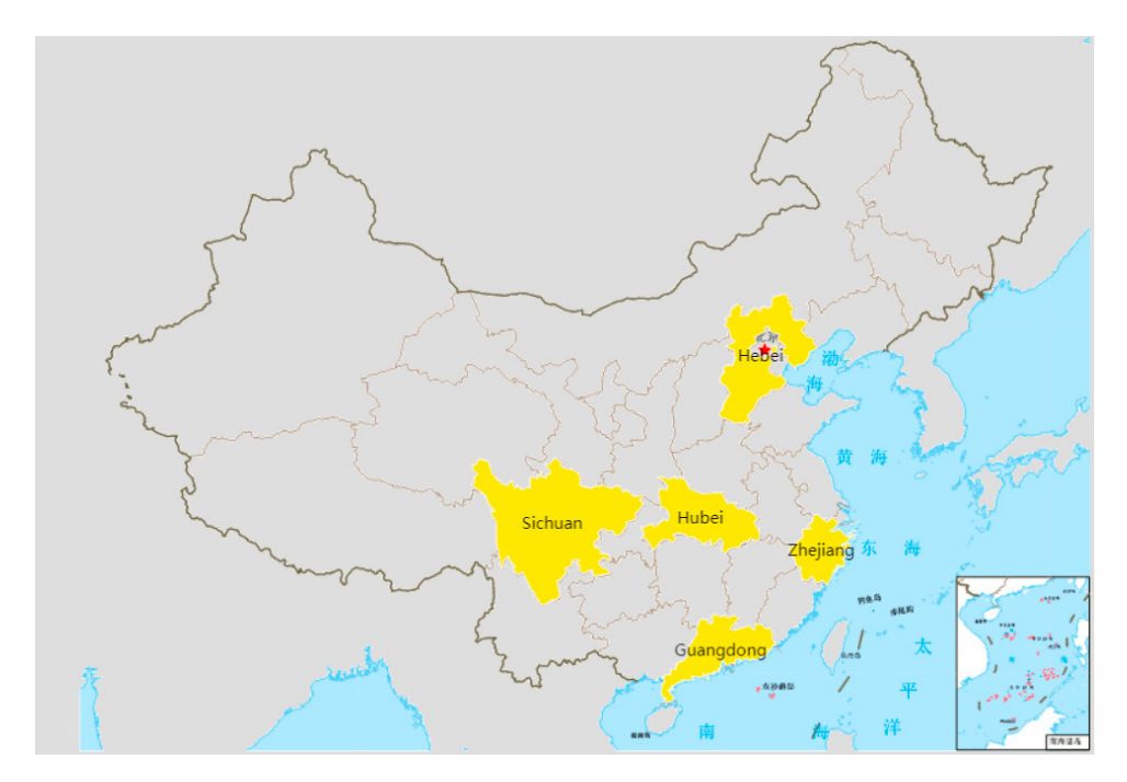
Figure 2. Map of the sample collection sites in China.