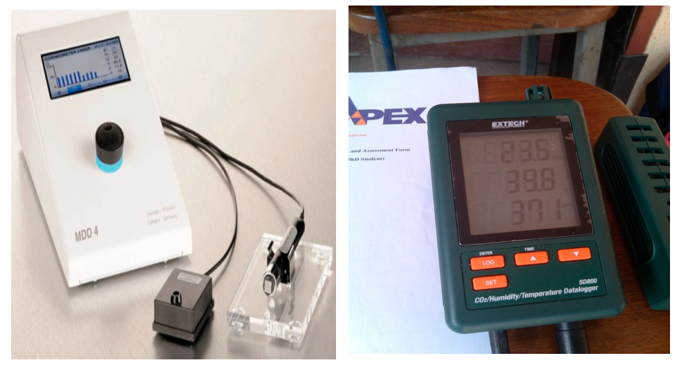
(a) Erythema index meter (b) indoor air quality meter.

The erythema-induced allergic response was measured using an erythema index meter (EIM), also known as MX18 [11,12], as shown in Figure 1a. The meter was calibrated and equipped with a probe to measure the chemical-induced skin injury corresponding to the erythema index (EI) of the participants in a susceptive environment. The EI in this study is defined as the threshold of epidermal damage that characterized the quantitative measurement of the biophysical characteristics of laboratory workers. The highly sensitive measurement gives values on a broad scale (0–999) on the measurement tools, with 92% sensitivity for erythema classification so that even the smallest changes in color as a result of haptens under the skin layers become traceable. The probe is diminutive and lightweight for easy handling and measurement on all body sites. A probe head ensures constant pressure on the skin enabling exact, reproducible measurements in a susceptible environment.