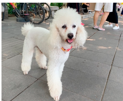
Figure 2. Didi accompanies interviewee No. 8 to a dance.

Didi not only gives her non-human support but also helps her obtain interpersonal support through an extended social network.