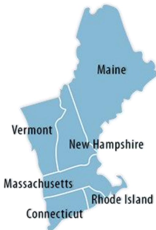
Figure 2. The New England region.

different groups and populations may have a different understanding, concepts, and values. As a qualitative research study, the researcher needed to select a targeted region for the research activity. In order to understand the holistic situations and issues of an American region, the researcher invited participants from each of the State within the New England region in the Northeast. Figure 2 showed the map of the New England Region.