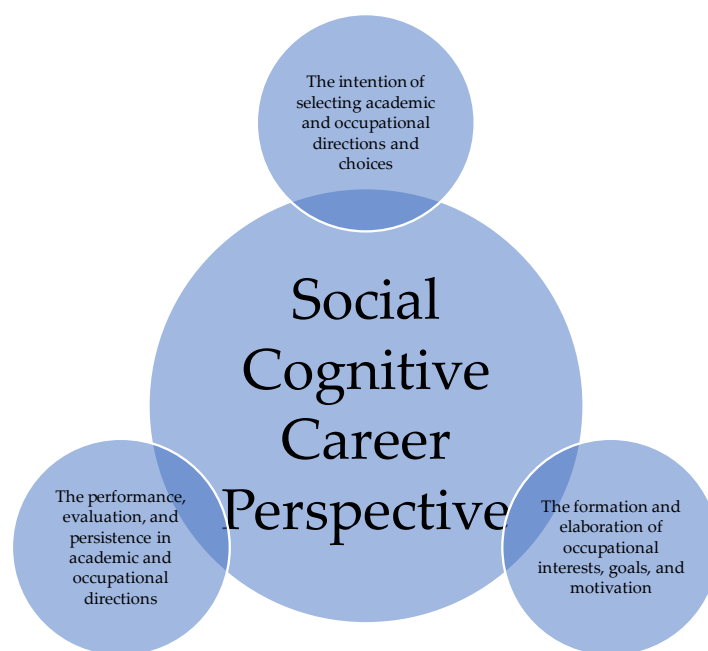
Figure 1. The relationships of the elements of the Social Cognitive Career Theory.