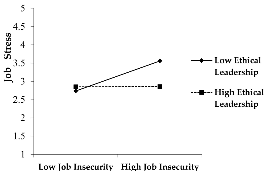
Figure 3. Moderating Effect of Ethical Leadership in the Job insecurity–Job Stress link.

The interaction term ( \beta = -0.20, p < 0.001 ) was statistically significant, indicating that ethical leadership negatively moderates the job insecurity–job stress link by functioning as a buffering factor. It means that when the degree of ethical leadership is high, the increasing influence of job insecurity on job stress would be diminished, which supports Hypothesis 5 (Please See Figure 3).