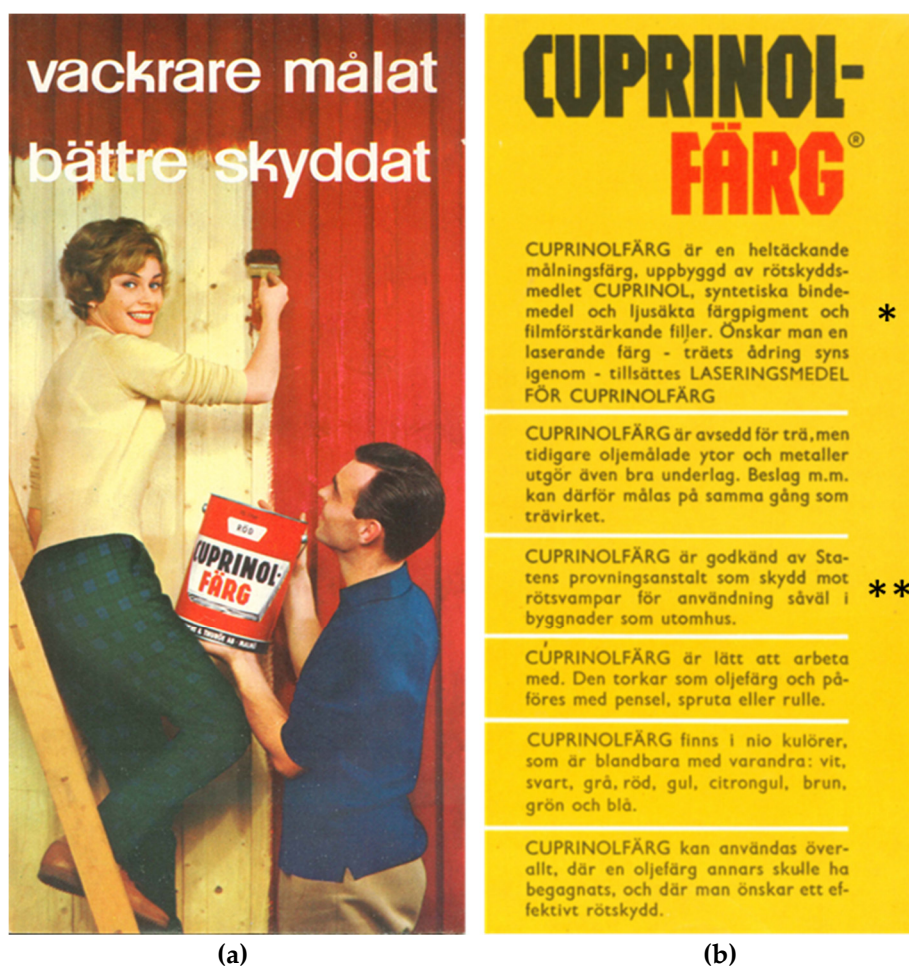
Figure 4. (a) Front page of an advertisement pamphlet “ More beautifully painted, better protected ” (tr), issued by Bönnellyche & Thuröe AB, dated 9.3.1960. (the company does not exist today [45]). (b) Content informs that * “CUPRINOL PAINT is made of the preservative CUPRINOL” (tr) and ** “approved by the National Testing Institute for protection against wood decay fungi for use both in buildings and outdoors” (tr).

of well-known labels, such as Cuprinol. Moreover, CPs left few traces in later documents. When STSK/I presented historical amounts of impregnated wood in 1984, it was neither possible to see trade names, nor the past use of CPs, due to changed categories of product compositions [41]. It seemed as if CPs had never occurred indoors in Sweden, e.g., in a large newspaper article covering a court case in Western Germany, “ Did the children die of the dangerous paint? ” (tr) [42]. Furthermore, two reports from SP stated, in a discussion on indoor air CPs in Western Germany, that “beside volatiles from creosote, no cases of active preservatives have been reported in the Nordic countries” [43,44].