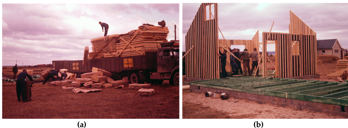
Figure 3. (a) Delivery in the early 1960s of a house from ÅsedaHus, one of many companies that produced prefabricated homes in the 1960s and 1970s [32], as well as, e.g., kindergartens, schools and offices. (b) The house is erected on a ventilated crawlspace with preserved wood (green) that will eventually be invisible below the interior flooring. ÅsedaHus used KP-Cuprinol for impregnation and chlorophenols (CPs) for dipping, as reported by the company [33] and supported by historical investigation before sampling of soil [34] and analyses of polluted soils showing CPs and dioxins at the manufacturing site [35].

(oil and PCP) was less used but, as advertised by Swedish British Petroleum [31], it was used by leading producers of timber and prefabricated homes, e.g., Mo och Domsjö and Hulfredshus, respectively.