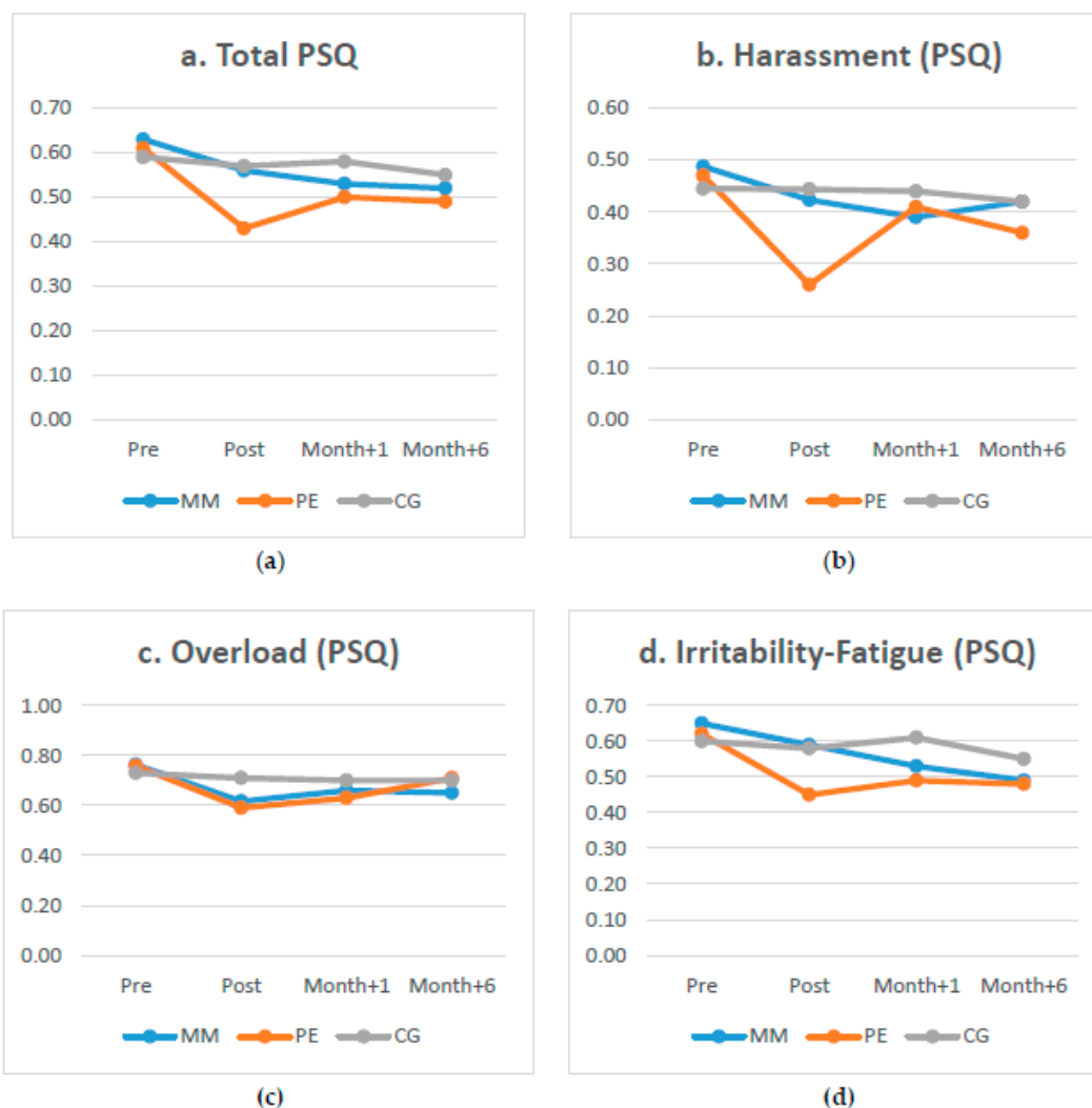
Figure 2. (a) Perceived Stress Questionnaire (PSQ) (b) Harassment-Social acceptance of the Perceived Stress Questionnaire (PSQ) (c) Overload dimension of the Perceived Stress Questionnaire (PSQ) (d) Irritability-Tension-Fatigue dimension of the Perceived Stress Questionnaire (PSQ).

of stress. Last, we cannot find an explanation for the slight improvement in the results of the control group on perceived stress. However, these are not significant results.