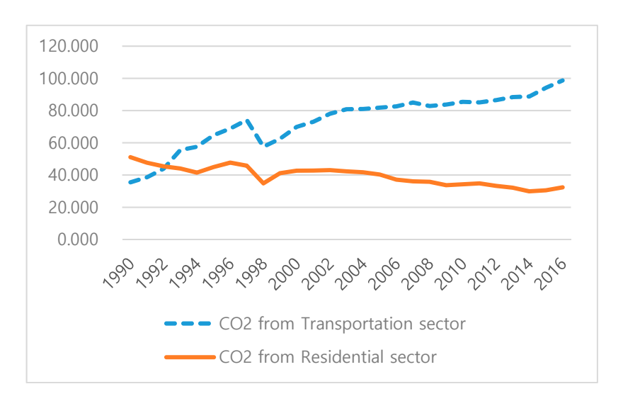
Figure 2. CO<sub>2</sub> Emissions from transportation and residential sector in Korea (mil. ton of CO<sub>2</sub> eq).

Figure 2 depicts CO_2 emissions from the transportation and residential sectors. In Figure 2, we may notice that CO_2 emissions from the transportation sector (blue dashed line) are continuously increasing, but these from the residential sector (orange solid line) are decreasing.