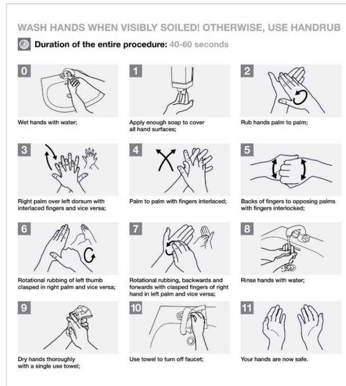
Figure 4. How to Hand Wash? [From: WHO Patient safety. Hand Hygiene: Why, How & When? Revised August 2009 https://www.who.int/gpsc/5may/tools/workplace_reminders/en/ (Accessed on 24 March 2020)].