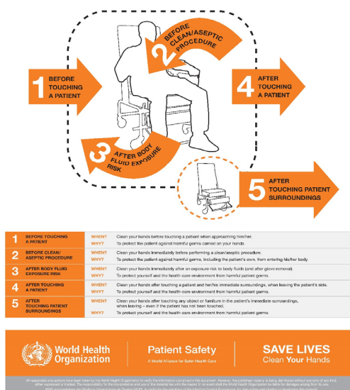
Figure 3. Moments For Hand Hygiene [from WHO Clean care is safer care Your 5 Moments for Hand Hygiene https://www.who.int/gpsc/5may/tools/workplace_reminders/en/ Revised August 2009 (Accessed on 24 March 2020)].