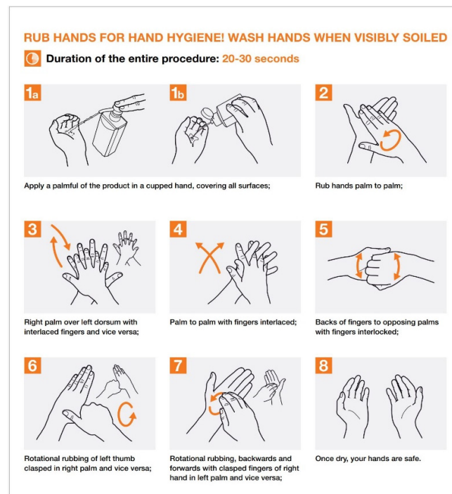
Figure 5. How to Hand Rub? [From: WHO Patient safety. Hand Hygiene: Why, How & When? Revised August 2009 https://www.who.int/gpsc/5may/tools/workplace_reminders/en/ (Accessed on 24 March 2020)].

Before performing hand hygiene procedures, it is suggested to: