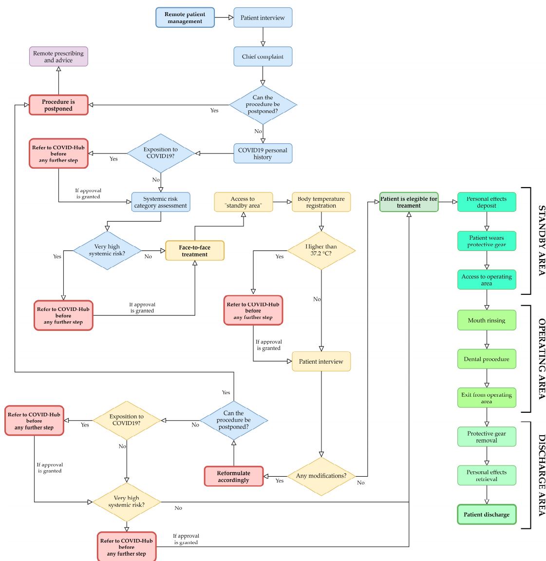
Figure 2. Proposed flow-chart for patient management.

A flow chart for the proposed patient management is shown in Figure 2.