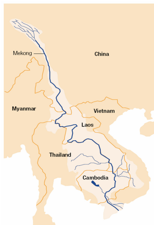
Figure 1. Member countries of LMC.

The Lancang-Mekong River is one of the world's major river, ranked second after Amazon in respect to biodiversity. China, Laos, Myanmar, Vietnam, Thailand and Cambodia are six countries alongside this river, with a population amounts to 72 million live within the Mekong basin (as is demonstrated in Figure 1). LMC as a transnational organization encompasses the aforementioned six countries alongside Lancang Mekong river. LMC proposes to contribute in the area of social and political issues, sustainable development among its member countries, along with culture communication [10]. Among the aforementioned objectives, sustainable development is of key significance. Countries of this region have witnessed enormous economic growth, while the side-effects of this increase such as inequality and environmental pollution have also evoked attention. As is demonstrated in Figure 1, countries alongside the Lancang-Mekong river have the opportunity to use renewable energy owing to its congenial rivers dropping variance. The demand for renewable energy has encouraged the construction of hydropower facilities in the Lancang-Mekong river valley [11]. During this process, trans-boundary cooperation among its members will yield a win-win outcome to all collaborators in terms of both economic development and environmental protection.