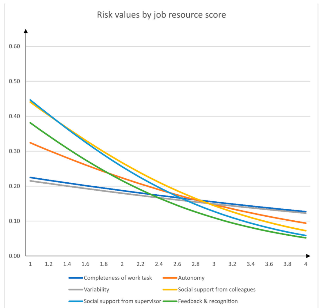
Figure 2. Relationship between job resources and risk for psychological health impairment.

To further illustrate the capacity of the approach to distinguish between high risks and low risks for psychological health impairment, we calculated cross tables for low and high scores of the job stressor and job resources scales and psychological health impairment. As the cutoff value, we used the job stressors or job resources score derived from the logistic regression analysis that was related to a double risk ( p = 0.30 ) for psychological health impairment compared to p = 0.15 as the general prevalence in the sample (this was not applicable for completeness of tasks, variability, and work interruptions). We then divided the sample into groups below and above these cutoff values and counted the number of cases with and without psychological health impairment. Table 5 displays the frequencies of stressor–health–impairment combinations. We applied the approach proposed by [40] to provide person-oriented effect sizes based on percent correct classifications (PCC) in the way that questionnaire scores from and above the defined stressor cutoff scores (respectively from and below the defined resource cutoff scores) predict psychological health impairment. As illustrated in Table 5 for the listed job stressors and job resources, the total of correct classifications (i.e., true positives + true negatives) was at least 81.85%.