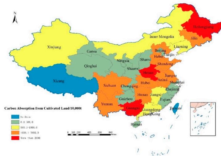
Figure A1. The total carbon absorption of arable land in China’s provinces in 2010.