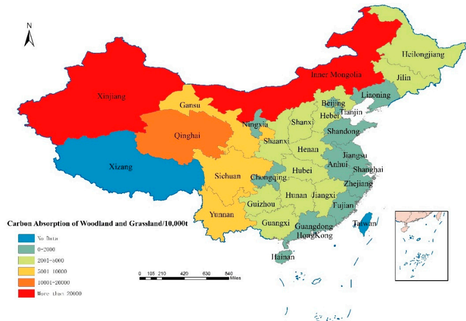
Figure 2. The total carbon absorption of China's woodland and grassland in 2019.

tons, respectively, accounting for 36.64% of the country's total grassland and woodland carbon absorption. Tianjin, Beijing and Shanghai have the least carbon absorption from woodland and grassland, with 0.69 million tons, 1.86 million tons and 0.34 million tons, respectively, accounting for only 0.16% of the national total carbon absorption from woodland and grassland. In addition, China's woodland and grassland carbon uptake is geographically high in the west and low in the east. The total carbon uptake of forestland and grassland in Qinghai is 171.67 million tons, followed by Sichuan, Gansu, and Yunnan, with 96.19 million tons, 84.51 million tons and 72.26 million tons, respectively. The carbon absorption of forest land and grassland in the eastern coastal provinces is relatively small. For example, the amount of carbon absorbed by forest land and grassland in Jiangsu was 1.95 million tons, and that in Shandong was 7.73 million tons.