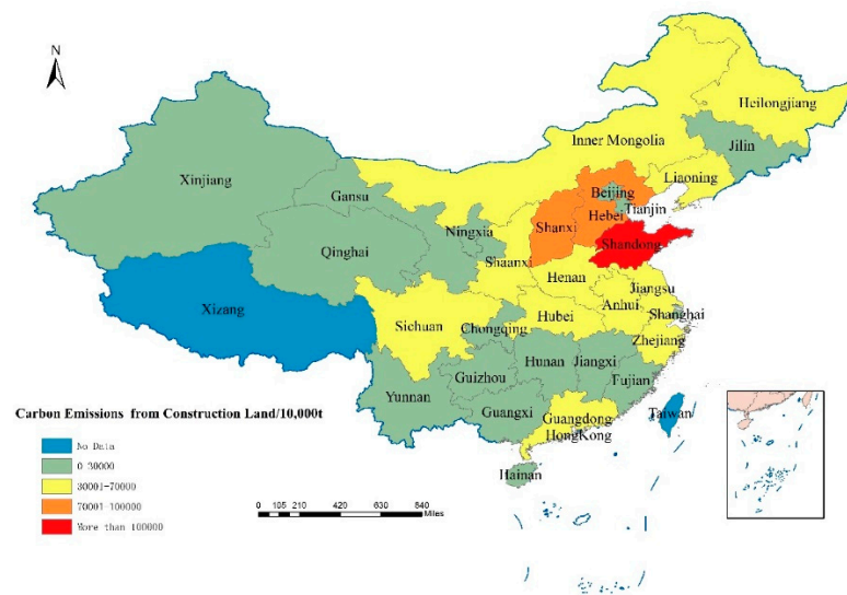
Figure A5. Carbon emissions from construction land in China’s provinces in 2010.