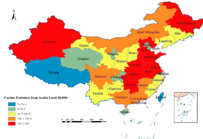
Figure A4. Total carbon emissions from cultivated land in China’s provinces in 2019.