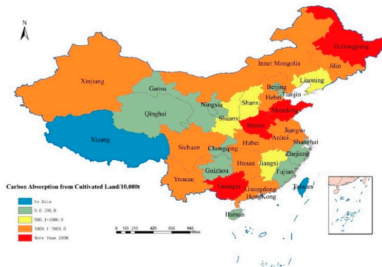
Figure A2. The total carbon absorption of arable land in China’s provinces in 2019.