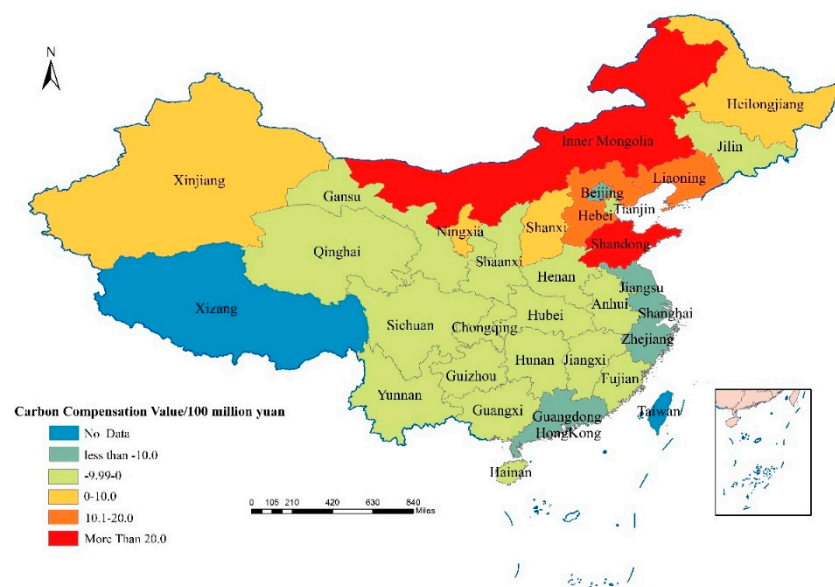
Figure 5. The calculation results of the carbon offset value of China’s provinces in 2010.