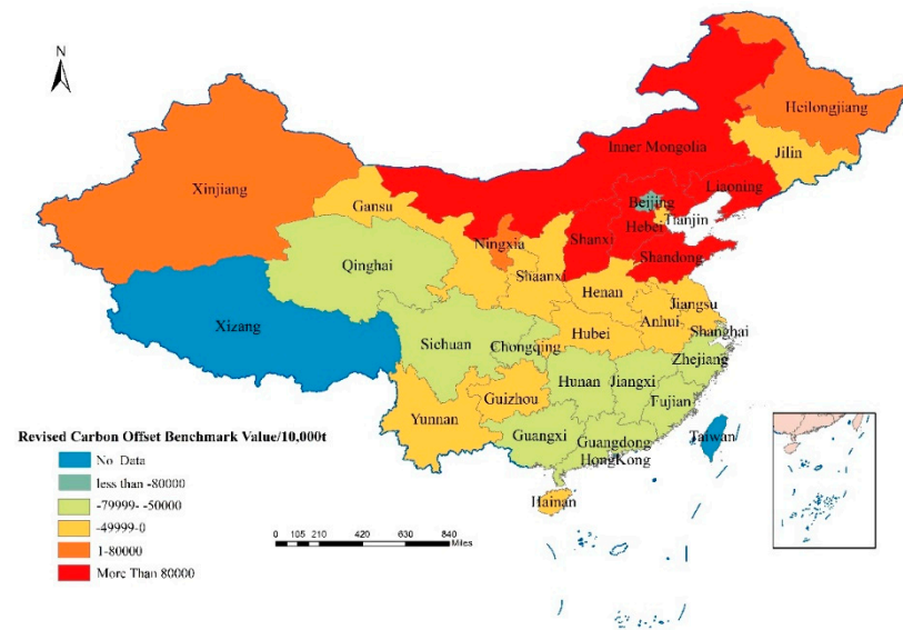
Figure 3. Revised carbon offset benchmark values of all provinces in China in 2010.