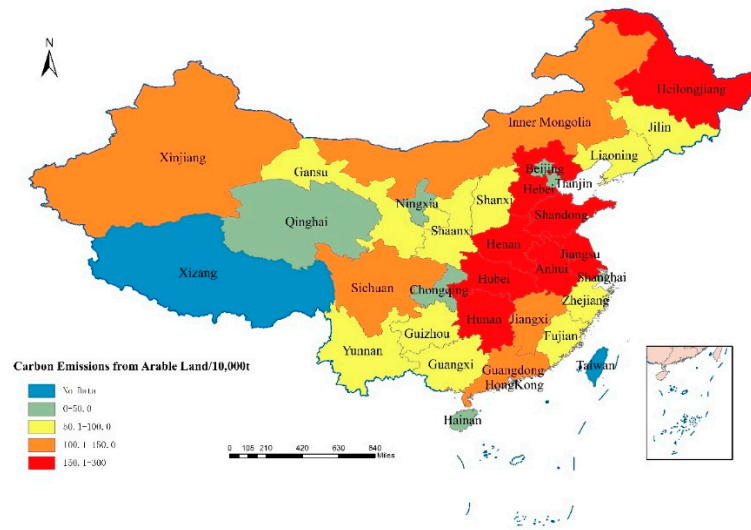
Figure A3. Total carbon emissions from cultivated land in China’s provinces in 2010.