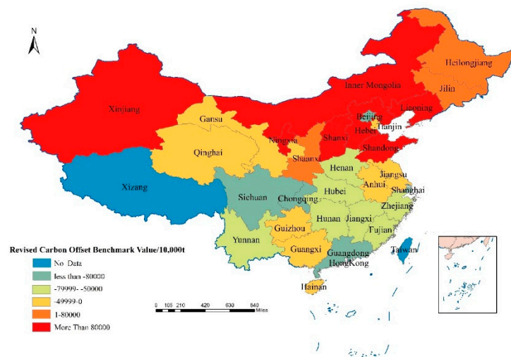
Figure 4. Revised carbon offset benchmark values of all provinces in China in 2019.