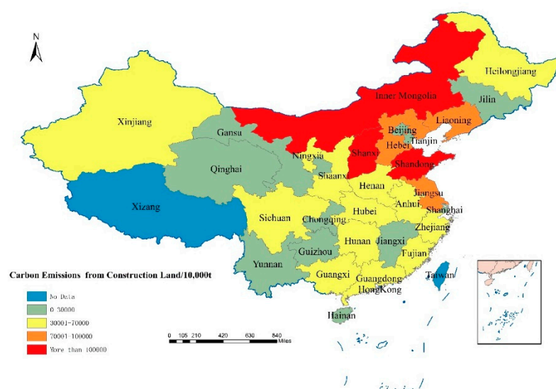
Figure A6. Carbon emissions from construction land in China's provinces in 2019.