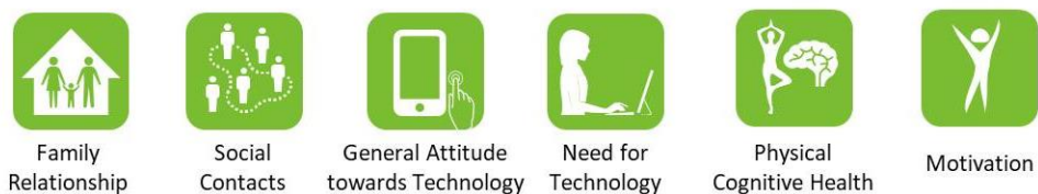
Figure 1. Case 1—Representative character to present positive attitude towards technology.