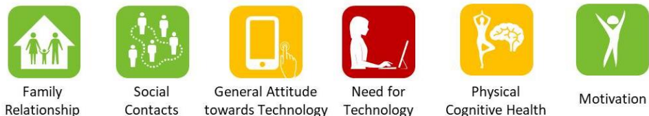
Figure 4. Case 4—Representative character to present social use of technology.