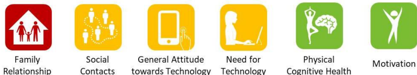
Figure 5. Case 5—Representative character to present diverse use of technology.