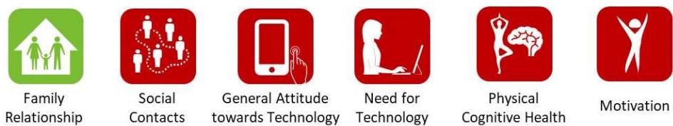
Figure 3. Case 3—Representative character to present family oriented use of technology.