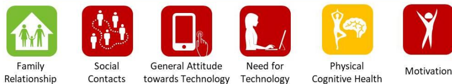
Figure 2. Case 2—Representative character to present negative attitude towards technology.