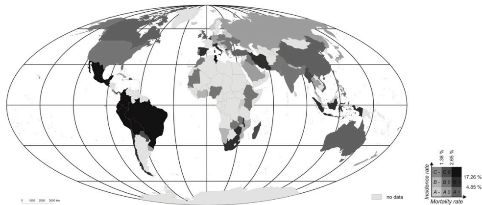
Figure 4. The classification of countries by indices of both COVID-19 morbidity and mortality—in the period from the first reported cases of the disease through to 18 November 2020; A−, low-morbidity/low-mortality countries where COVID-19 is concerned; A0, low-morbidity/average-mortality countries; A+, low-morbidity/high-mortality countries, B−, average-morbidity/low-mortality countries; B0, average-morbidity/average-mortality countries; B+, average-morbidity/high-mortality countries, C−, high-morbidity/low-mortality countries; C0, high-morbidity/average-mortality countries; C+, high-morbidity/high-mortality countries. Source: authors’ own elaboration.