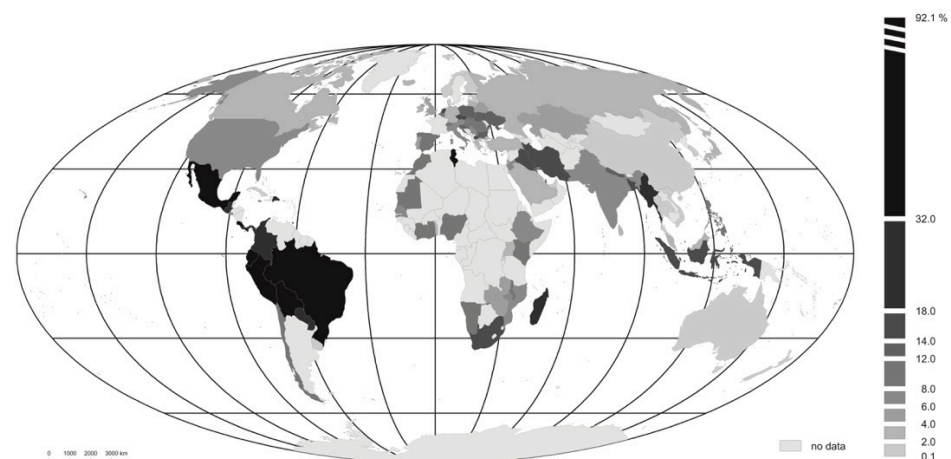
Figure 2. The COVID-19 morbidity index ( Wc_{i,j} ) in different countries, in the period from the first recorded case of the disease through to 18 November 2020.

The highest indices for COVID-19 morbidity (Figure 2) are those reported for Latin American countries: Brazil (92%), Peru (83%), Costa Rica (52%), Mexico (45%) and Bolivia (42%). Somewhat further down the list there are other countries from the same region (i.e., Guatemala, the Dominican Republic and Panama). It must be noted that these countries also have very low indices for testing, with the effect that values of the Wc_{i,j} statistic are raised markedly. At the other extreme, values for the index are decidedly the lowest in East Asian countries (China and Vietnam—0.1% and Thailand 0.4%), along with Australia (0.3%), New Zealand (again a mere 0.1%) and Fiji (0.2%).