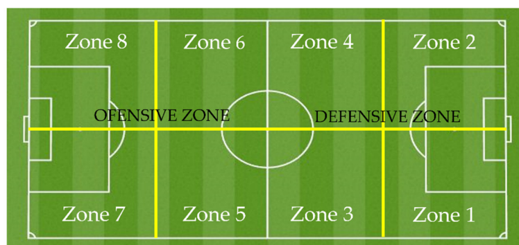
Figure 1. Field areas.

The categorisation of the type of injury followed the UEFA model [22]. To designate the part of the body where the injury occurred, a classification endorsed by other authors was used [23–25]. Four demarcations were used for the analysis [14,19,25,26] and divided the match into 15 min intervals [5,9].