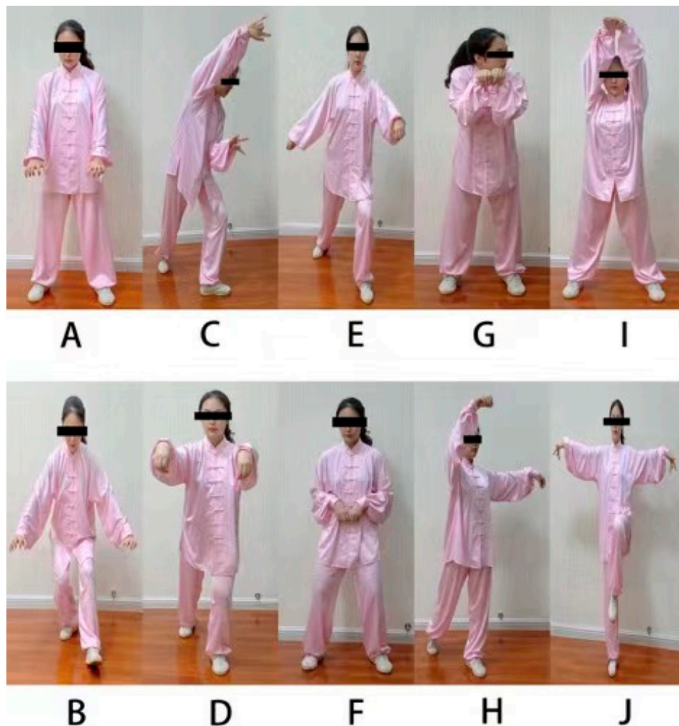
Figure 1. Ten forms of Wuqinxi Qigong. (A). Form 1: Raising the tiger’s paws; (B). Form 2: Seizing the prey; (C). Form 3: Colliding with the antlers; (D). Form 4: Running like a deer; (E). Form 5: Rotating the waist like a bear; (F). Form 6: Swaying like a bear; (G). Form 7: Lifting the monkey’s paws; (H). Form 8: Picking fruit; (I). Form 9: Stretching upward; (J). Form 10: Flying like a bird.

instructor gave instructions and demonstrations, requiring participants to count or recite each form of Wuqinxi while practicing, as well as focus on maintaining balance, posture and action consistency.