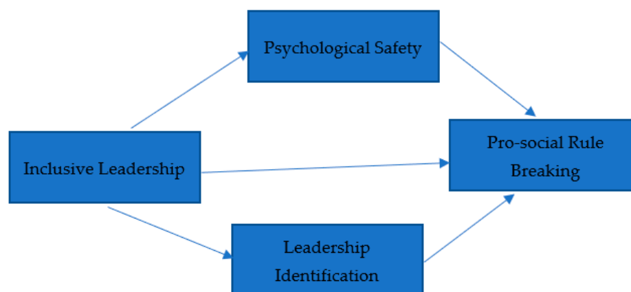
Figure 1. Conceptual Framework of the Present Research.

This study also examines the intervening mechanisms of PsySaf and LI on the relationship between INCL and PSRB. The behavior of the leader and his actions steer the individual psychological changes. When employees have a higher level of PsySaf, their level of “daring to do it” is increased, which ultimately induces them to engage more in PSRB. Individuals with higher PsySaf dare to be involved in risky behaviors and vice versa. A high level of PsySaf is attained through a safe and supportive environment. Thus, the characteristics of inclusive leadership also provide support to employees to achieve a high level of PsySaf [24]. The present study also found a strong positive association between INCL and PsySaf, thus supporting the theoretical foundation provided by [23]. Hence, INCL affects PSRB directly and indirectly via PsySaf. Figure 1 presents the conceptual framework of the study.